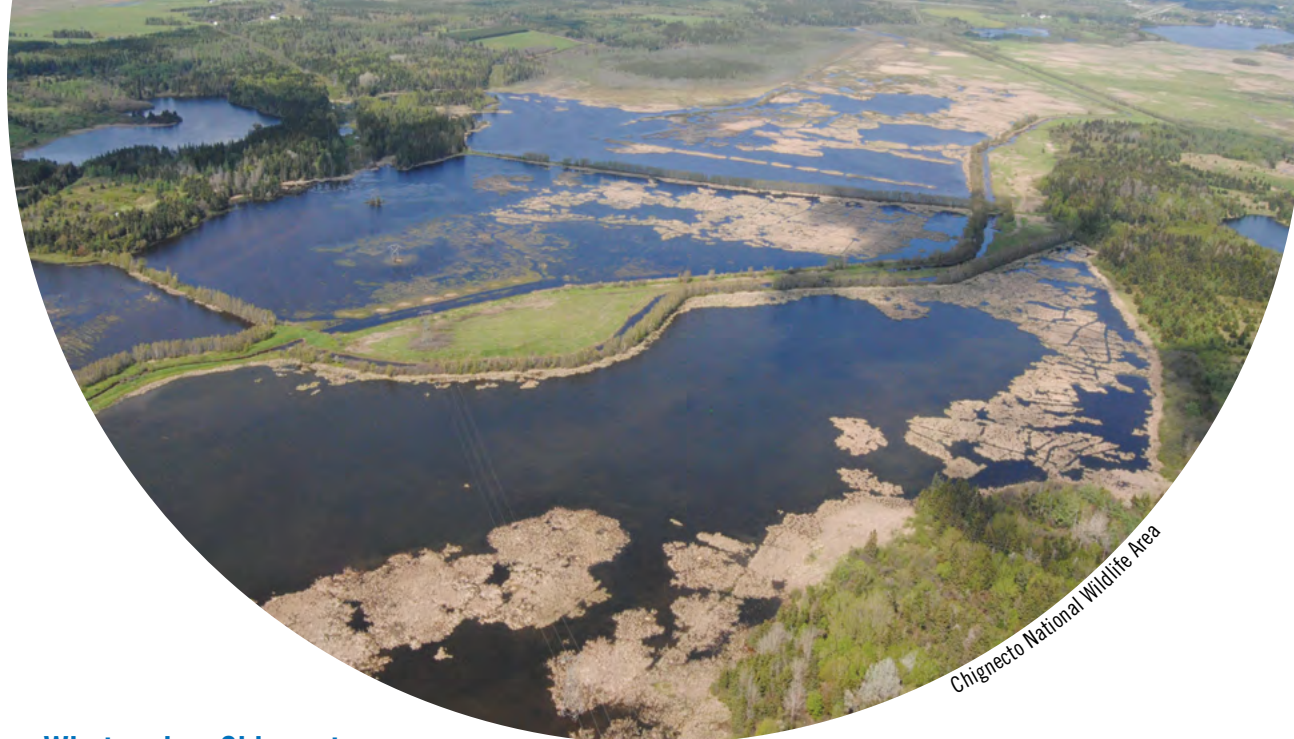
Chignecto National Wildlife Area

Access to Chignecto NWA is not restricted, and activities such as wildlife observation, hiking and photography are permitted. Walking trails are maintained within the NWA and can be accessed from a parking lot at Amherst Point. Hunting is not permitted within the Chignecto NWA or Amherst Point MBS, but trapping is allowed, subject to provincial regulations.