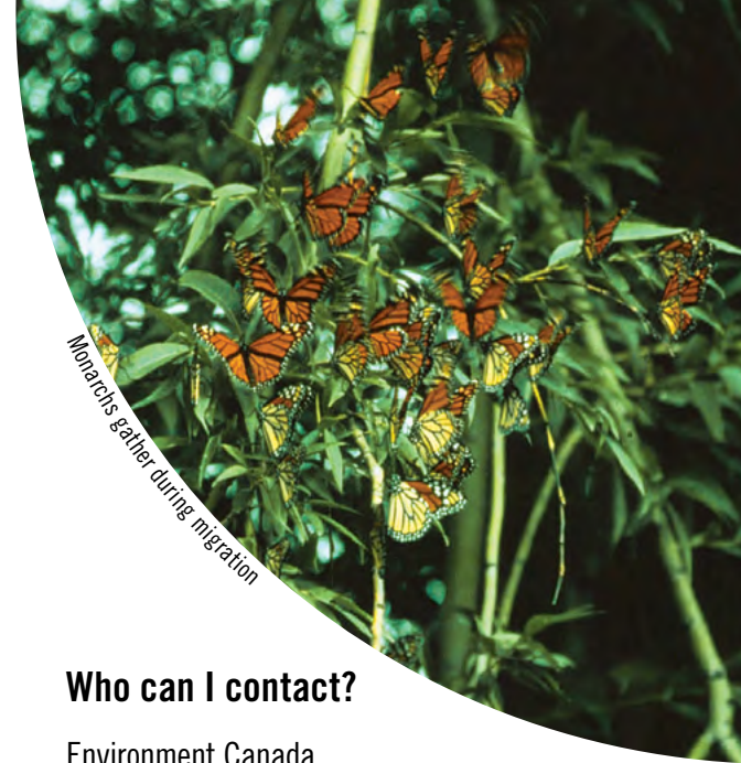
Monarchs gather during migration