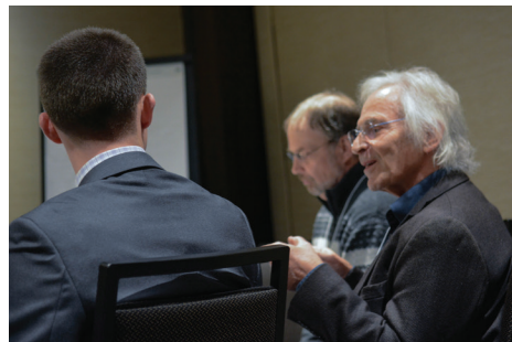
Small group breakout sessions.