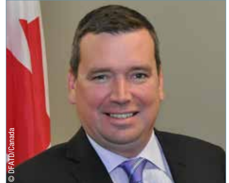
The Honourable Christian Paradis, P.C., M.P.

A more prosperous, democratic, equitable and peaceful world is in everyone's best interests. Canadians can continue to be proud of what their government has done to improve the lives of people in developing countries.