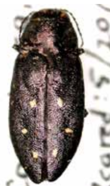
Figure 5b. Adult hemlock borer.

In mixed stands, tree species associated with hemlock become more abundant. These changes lead to an increase in species richness and abundance as dying hemlocks give way to a wider array of plants, fungi and animals. However, these changes also lead to a significant reduction in the flora and fauna associated with distinctive hemlock-dominated ecosystems.