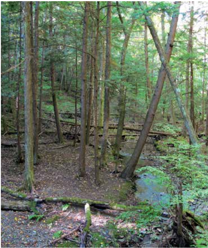
Figure 6. Healthy stand of eastern hemlock in Pennsylvania.

At the landscape level, a decreasing abundance of hemlock in pure stands leads to higher soil respiration, faster nutrient cycling, greater variation in stream flows and higher water temperatures.