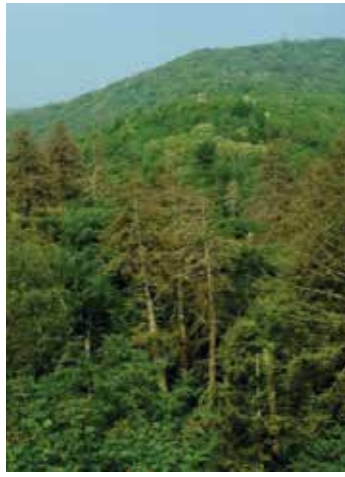
Figure 4c. Groups of infested trees with yellowish-grey-green coloured foliage (Photo: William Cielsa).

negative influence on populations of HWA. Because survival of sistens nymphs is significantly higher on new shoots than older shoots, the decreasing number of new shoots to infest, due to bud abortion and dieback, causes the population of HWA to decline rapidly.