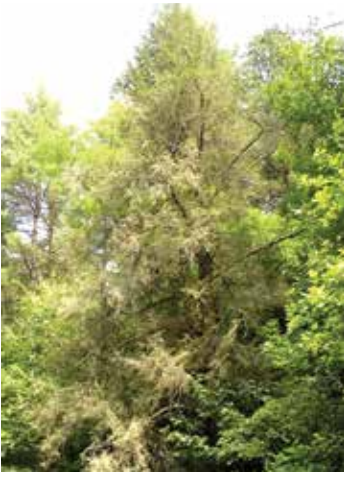
Figure 4b. Yellowish-grey-green colour of foliage of infested trees.