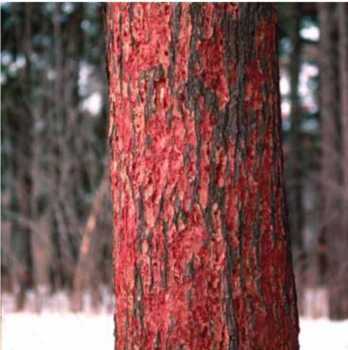
Figure 5a. Sign of the presence of the hemlock borer, Melanophila fulvoguttata (Harris), which can often attack hemlock trees stressed by the hemlock woolly adelgid, as revealed by foraging woodpeckers.

At this point, the severely stressed trees may succumb to secondary organisms, such as the hemlock borer, Melanophila fulvoguttata (Harris) (Fig. 5a, 5b) or root disease, Armillaria mellea (Vahl:Fr.) Kummer. If instead the tree begins to recover and produce new shoots, the HWA population will eventually rebound as well. Rebounding HWA populations often cause too much stress for recovering trees and lead to tree death. Observations in the U.S. indicate that HWA has resulted in greater than 90% mortality of infested hemlocks.