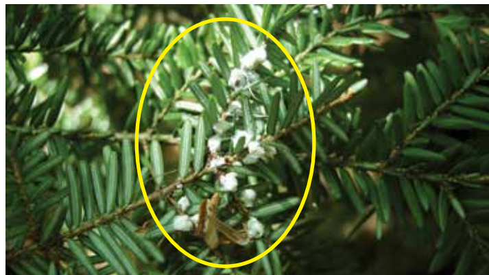
Figure 3. HWA sistens nymphs and eggs inside a white woolly mass along the main stem of infested shoots of eastern hemlock near Niagara Falls, Ontario, in 2013.

Sistens adults lay about 150 progrediens eggs inside their woolly ovisacs in late April to early May (Fig. 3). In May, progrediens crawlers hatch and settle at the base of a needle on the same shoots amongst their sistens mothers (e.g., on last year's new shoots). Progrediens nymphs take about a month to complete development. Progrediens adults lay about 25 sistens eggs inside their ovisacs (Fig. 3).