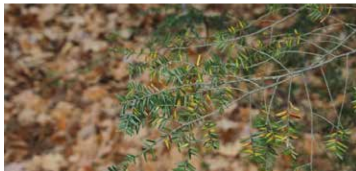
Figure 4a. Shoot dieback and chlorosis of older needles of eastern hemlock infested by the hemlock woolly adelgid.

The presence of white woolly masses on shoots on the underside of hemlock twigs is a clear sign that trees are infested by HWA (Fig. 3). Some of the symptoms of injury include abortion of buds, chlorosis (yellowing of foliage), needle loss and dieback of new shoots (Fig. 4a). Heavily infested hemlock trees will look greyish-green from a distance, with thinning crowns (Fig. 4b, 4c). Once significant dieback of shoots and needles occurs on the tree, the accompanying loss of tree vigour exerts a