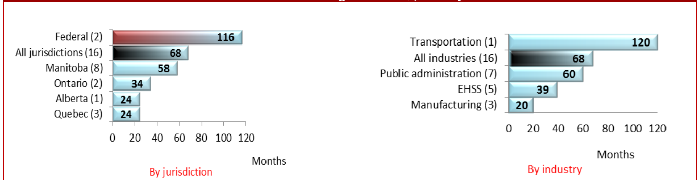
Chart 3: Duration of agreements, January 2016