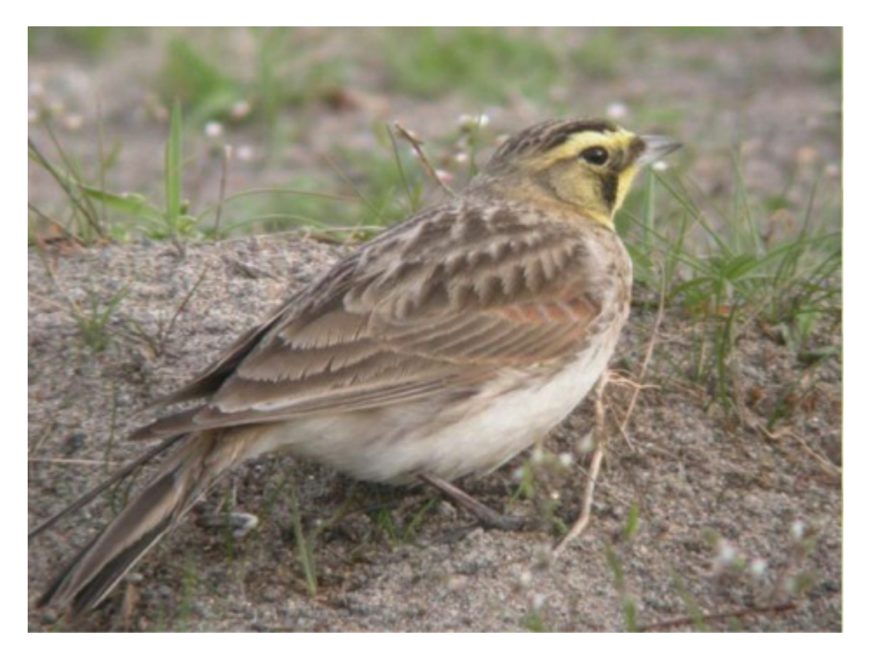
Figure 1: Streaked Horned Lark (Randall Moore).