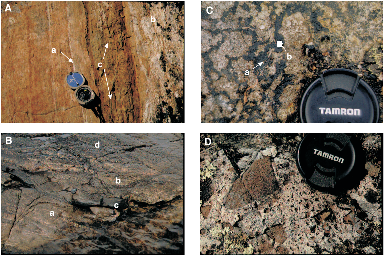
Figure 3. A) Anatectic greywacke-mudstone with thin, melted pelitic layers (a) and a thick, locally derived, injected granodiorite layer (b). Crossbedded lenses defined by thin, recessive-weathering biotite layers in psammite (c) preserve younging direction (to right). Compass indicates north. B) Medium-grey, isoclinally folded tonalite (a) cut by strongly foliated leucotonalite (b) with deformed (?) mafic dyke or (?) amphibolite xenolith (c), and all units cut by cumulate-textured gabbro (d). Lens cap approximately 5 cm in diameter. C) Coarse-grained, cumulate-textured gabbro with subhedral plagioclase in hornblende matrix. Contains approximately 1% orthopyroxene (a) and clinopyroxene (b) interstitial to hornblende. Lens cap approximately 5 cm in diameter. D) Brecciated diabase dyke trending 022°. Angular diabase fragments are entrained in a fine-grained, leucocratic matrix. Lens cap approximately 5 cm in diameter.

assemblage quartz-plagioclase-biotite±sillimanite±cordierite (nodular variety)±andalusite±cordierite (iolite)±tourmaline±apatite. Nodular cordierite and andalusite porphyroblasts are partially replaced, to wholly pseudomorphed, by sillimanite and are therefore lower grade relicts. Iolite occurs as variably pinnitized blue-grey crystals of similar size to the groundmass. Neosome occurs as abundant, foliation-parallel blebs and foliation-parallel lenses of anatectic melt, as well as varying proportions of locally derived, injected melt. Anatectic melt within the migmatite varies in composition from haplogranitic through tonalitic. Neosome near the melt-in isograd (first appearance of anatectic material) is commonly monzogranitic. Up-grade of the melt-in isograd, neosome compositions show more variability, ranging from biotite-muscovite±iolite±garnet±sillimanite±tourmaline monzogranite through biotite±muscovite±garnet±iolite tonalite. Of these two end-members, intermediate granodioritic compositions are most