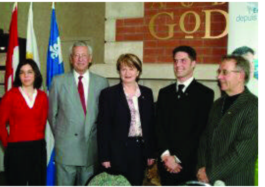
them to acquire, start up, expand or modernize their business. It also promotes the employability of young people while emphasizing their social, cultural and economic commitment in areas remote from the large cities of Quebec.

The CED/CFDC Youth Strategy aims to slow the migration of youth to large urban centres by helping young men and women in rural areas build a promising future for themselves in their own communities. It helps young local entrepreneurs develop business plans in their own community and encourages