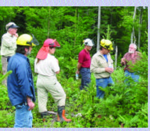
Workshop on controlling the white pine weevil and blister rust, Mont-Laurier, September 2004

The Forest Innovation Partnership is geared toward all forestry stakeholders interested in research and development, and knowledge and technology transfer. It targets small- and medium-sized businesses, such as forestry co-operatives, forestry group ventures, forestry developers and seedling production centres, which tend to be located in rural areas.