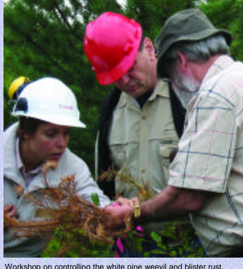
Vorkshop on controlling the white pine weevil and blister rust,

Innovation is the key to the future of forest-dependent communities in Quebec. To achieve this goal, research centres must make their expertise more readily available. The Forest Innovation Partnership's mission is to answer the needs of Quebec's forest-dependent regions and their communities by promoting innovative forest management through more effective knowledge transfer between researchers and users. This strategic alliance stems from an agreement between the