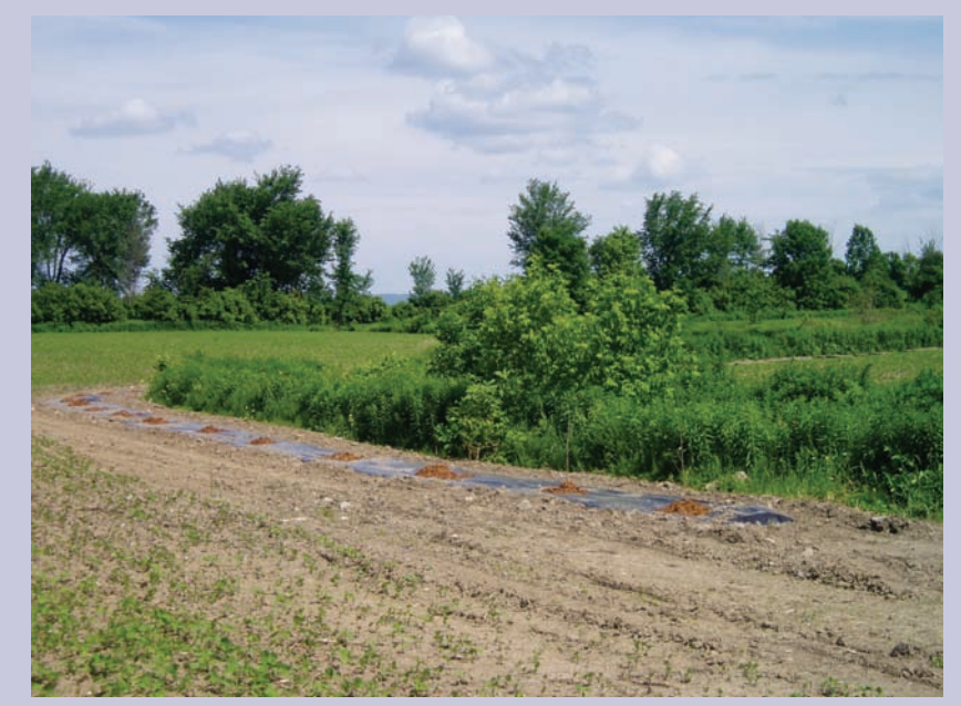
Restoration of the Vacher Brook banks .

In an approach geared towards collective action, Agriculture and Agri-Food Canada's Greencover Canada (GC) program ($3.6 million as of 2008) was created to provide financial support to farmers who wish to develop buffer strips on their farms. Farmers who want to fight erosion of the banks or plant buffer strips, shelterbelts or wooded corridors can receive a combined GC– Prime-Vert (Quebec Department of Agriculture, Fisheries and Food (MAPAQ) program) contribution of up to 70 per cent of eligible project expenses.