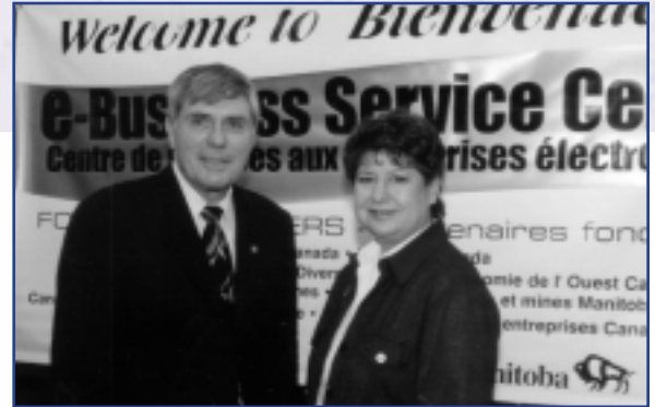
Dr. Duhamel with the Honourable MaryAnn Mihychuk, Manitoba Minister of Industry, Trade and Mines at the grand opening of the E-Business Service Centre.

The Honourable Ron J. Duhamel, Minister of Veterans Affairs and Secretary of State (Western Economic Diversification, Francophonie), and the Honourable MaryAnn Mihychuk, Manitoba Minister of Industry, Trade and Mines, were on hand to officially open the centre and congratulate all of the partners in the endeavour. The joint venture was first announced in June at the E-Business: A Small Business Perspective conference in Winnipeg, also a government initiative to assist businesses to explore electronic commerce.