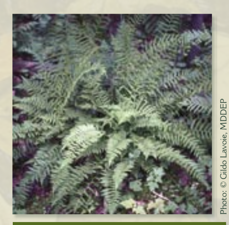
The Bog Fern grows in the shady areas of treed bogs such as the Venise Ouest bog. This species, listed as threatened in Quebec, occurs only in the most southerly part of the province.

in the Venise Ouest bog are preserved in perpetuity. The donation was made through Environment Canada's Ecological Gifts Program, which provides donors of ecologically sensitive land or partial interests in land with special income tax benefits.