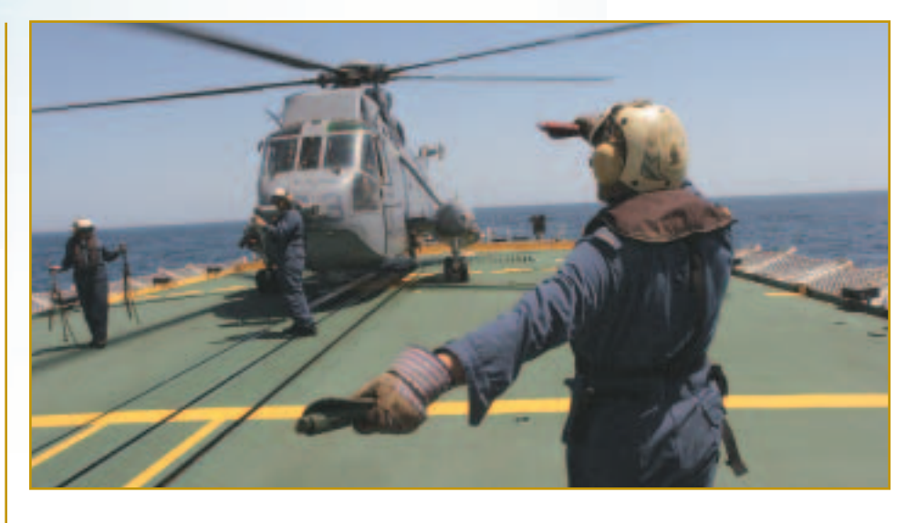
"Good people must have good equipment if they are to serve their country well, and equipment is an important aspect of operational quality of life. Some CF equipment is so old that it simply will not stand up to future operational demands."

irst and foremost, the CF must protect Canadians - and the boundary between the home front and the international environment has vanished. By taking part in efforts to end instability and conflict overseas, the CF contributes to the safety and security of Canadians at home. Therefore, the CF must be able to respond, not only to terrorist attacks at home and abroad, but also to threats from the roque states, failed states and organized crime groups that have made the world so very dangerous. The CF has been adapting to this new reality in our three missions of defending Canada, defending North America, and contributing to international peace and security.