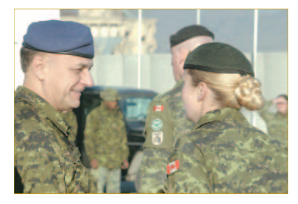
"Together, we will strengthen the CF, making it an even more relevant, credible and effective armed force for the future."

destroyed their vehicle, and in January one was killed and three were injured by a suicide bomber. These losses demonstrate to all Canadians that the world is dangerous and unstable, and the CF must sometimes operate in the presence of very real threats.