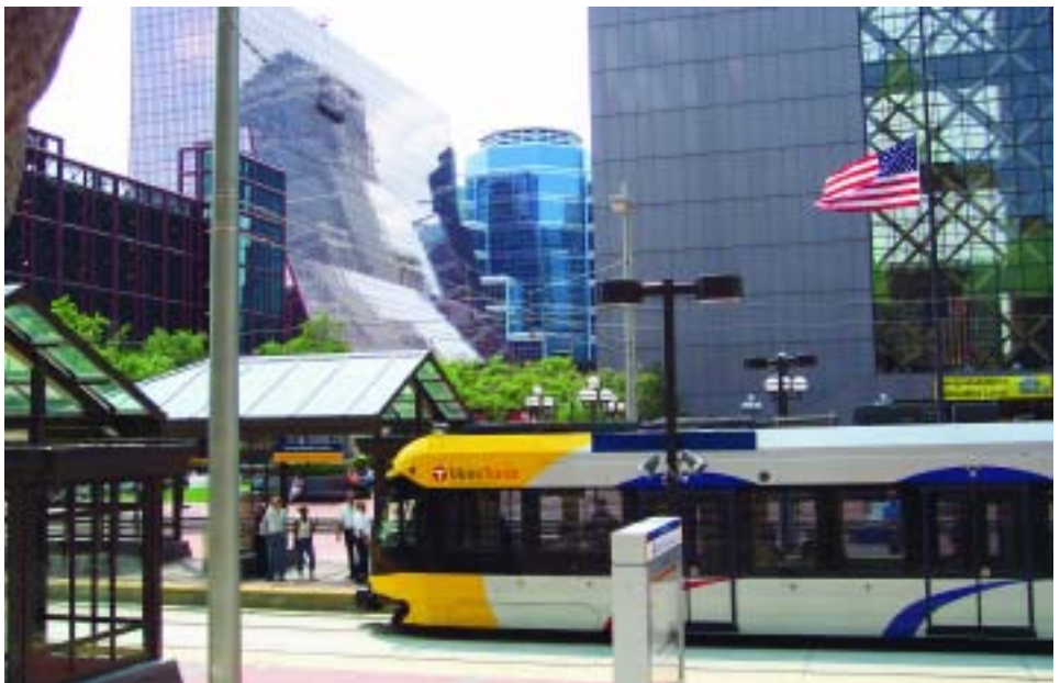
Bombardier's light rail transit system is up and running in Minneapolis-St. Paul, Minnesota.

Car shells for the LRVs are manufactured by Bombardier in Mexico with final assembly and testing taking place at the company's manufacturing site in Plattsburgh, New York.