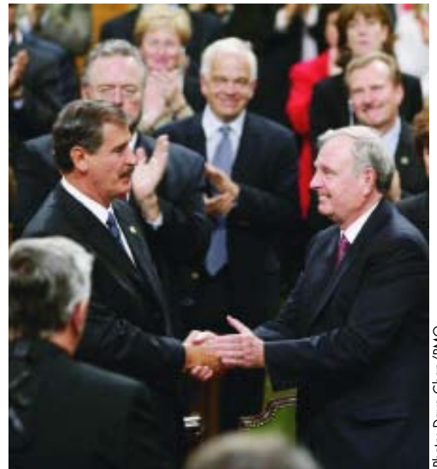
On October 25, 2004, Prime Minister Paul Martin and Mexican President Vicente Fox addressed Parliament.