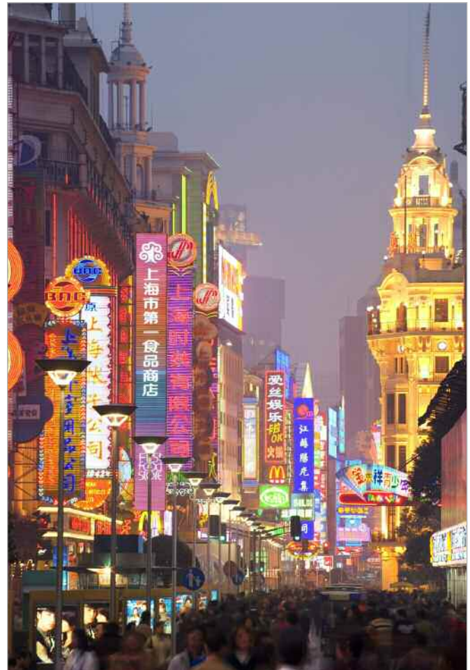
Canadians say China holds the greatest potential for exports and investment, according to a recent poll.

Regionally, there were differences in views about China. While Quebeckers were split on whether China or the U.S. holds more potential for exports and investment, the rest of Canada chose China over the U.S. by a margin of 18 percentage points. The gap in favour of China was even larger in western provinces, especially British Columbia, where 57% of respondents said China had the most potential, compared with only 18% who chose the U.S.