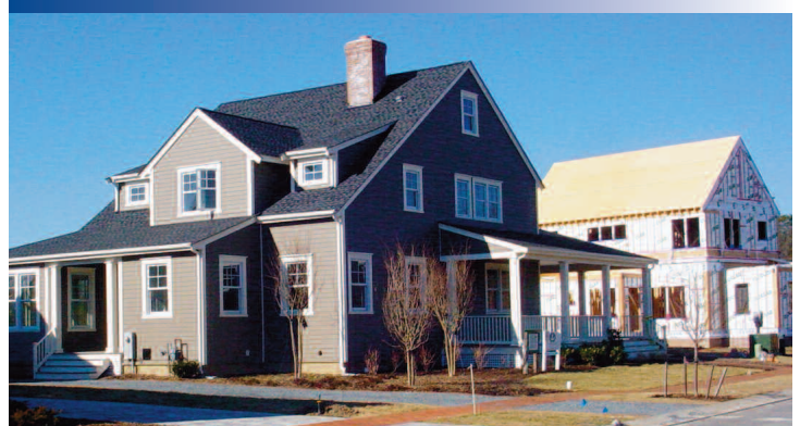
A DAC International home in Easton, Maryland.