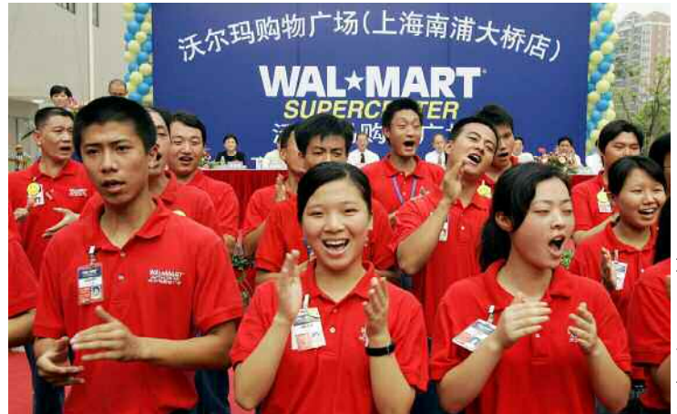
Chinese workers celebrate the opening of a Wal-Mart store in Shanghai.

He points out that more companies should take advantage of the Canadian Trade Commissioner Service when considering China as a market.