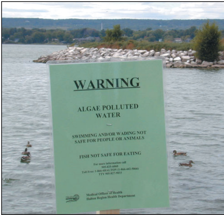
Toxic blue-green algae bloom in Hamilton Harbour, Ontario, August 2001.