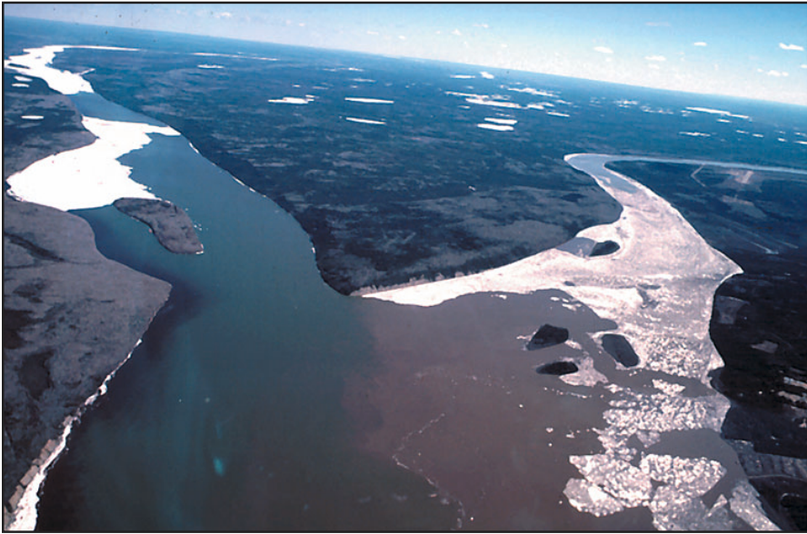
Ice breakup on the Mackenzie and Liard rivers: historical sources show earlier ice breakup and later freezing dates on lakes and rivers in recent years.