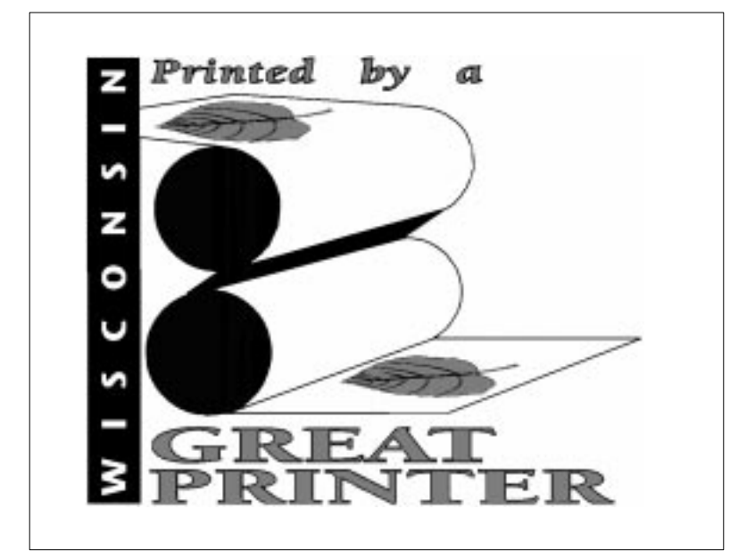
Great Printers Project

8.44 Federal and state regulators reduced redundancy in the requirements for obtaining permits and filing reports. They also agreed to create a level playing field through more efficient enforcement efforts, and clarified how they would use reported information. It is now easier for printers to understand their obligations