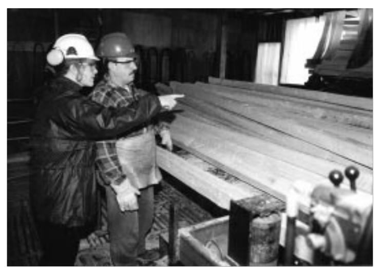
Eco-efficiency in the Saguenay

8.57 The Department gained practical insights into applying eco-efficiency concepts in small business as well as valuable experience for developing other such partnerships. It now has a kit of