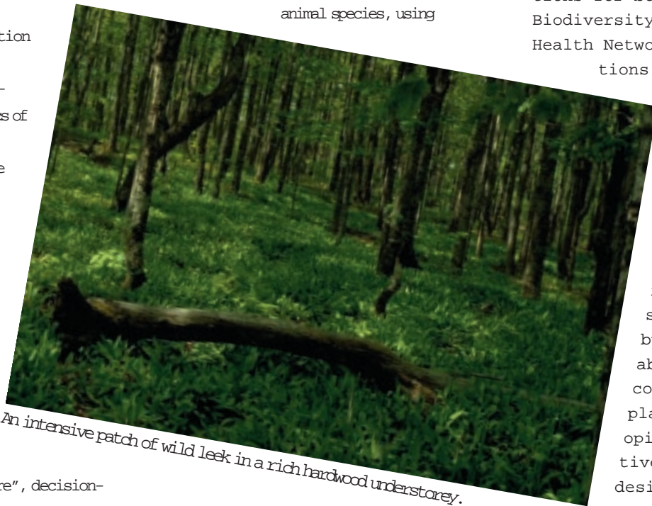
An intensive patch of wild leek in a rich hardwood understory.

wood production and conserving biodiversity. In developing a picture of the potential of the land to produce different types of products and values, McKenney hopes that we will be able to better understand the trade-offs in the decisions that we make. Bio-environmental indices are a series of measures that describe the most favorable environmental conditions for various plant and animal species, using