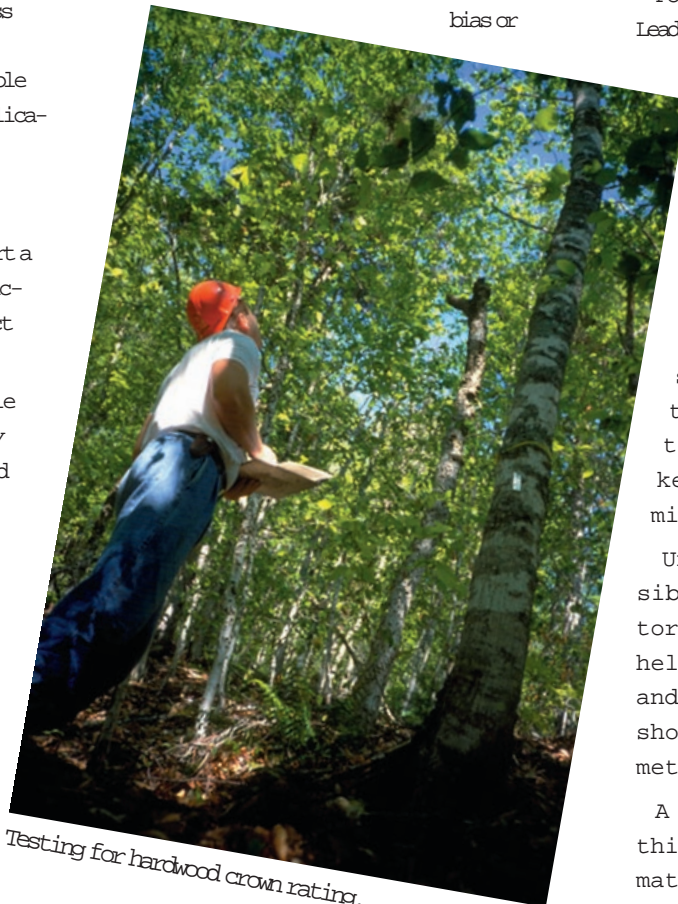
Testing for hardwood crown rating.

over several years can only provide meaningful data when observers are calibrated to the same level of understanding regarding parameter estimates. Assessments that reflect change must be "real" rather than the result of observer variability due to individual bias or