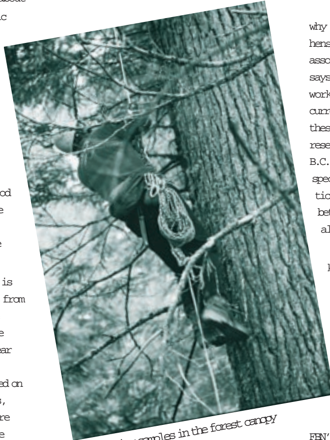
Collecting samples in the forest canopy

Collecting the branch and lichen samples is a formidable task. Samples are retrieved from the tree tops using a combination of rock and mountain climbing