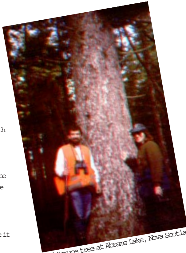
Red Spruce tree at Abrams Lake, Nova Scotia.

To initiate the project and foster collaboration, the Biodiversity Project recently hosted a mini-workshop entitled "Red Spruce: The Status of the Species Across Its Con-