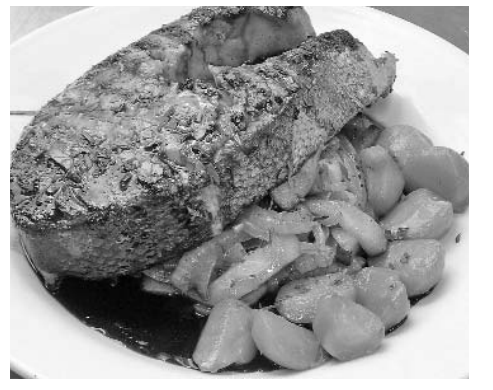
continued on page 4

Most Americans have listened to news stories extolling the anti-inflammatory health benefits of a diet rich in oily fish, such as salmon and mackerel, and their constituent polyunsaturated fat, omega-3 fatty acids. But left unanswered in these reports is how omega-3 fatty acids protect against heart disease, periodontitis, arthritis, and other inflammatory conditions. As published in the March 7 issue of The Journal of Experimental Medicine, NIDCR grantees and colleagues reported they have discovered that our bodies break down omega-3 fatty acids to yield important byproducts called resolvins, a newly discovered class of dietary fat. The scientists found that the subtype resolvin E1 in particular helps to stop the migration of certain immune cells to sites of inflammation, thereby modulating the severity of the immune response and reducing the risk of serious disease. Previously, the