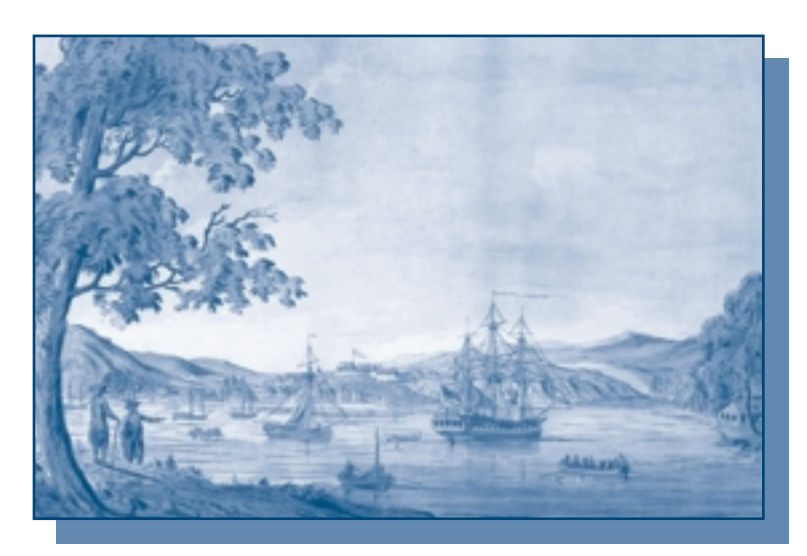
Annapolis Royal, N.S., J.F.W. Des Barres.

As we approach the year 2000, most Canadians probably don't think nearly as much about shipping as our ancestors did in 1900. Nevertheless, in 1998, Canadian ports handled over 376 million tonnes of cargo.