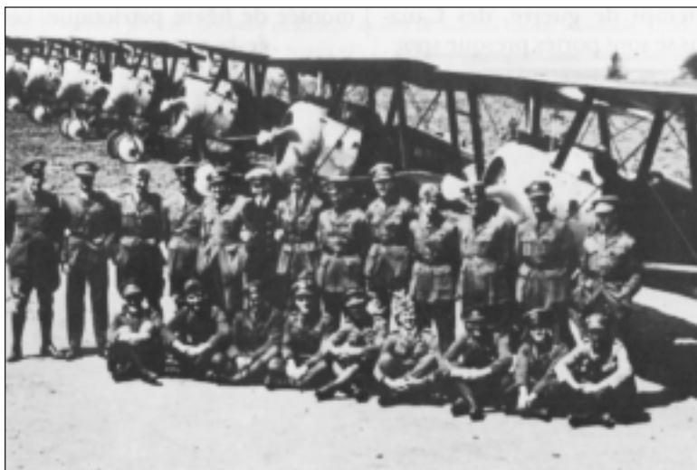
RCAF PILOTS IN FRONT OF SOPWITH FI. CAMEL AIRCRAFT DURING FIRST WORLD WAR.

When war has come, time and again Canadians have been quick to volunteer to serve their country. From farms, small towns and large cities across the country, men and women signed up, motivated by reasons like patriotism, ideological belief, family tradition, the seeking of adventure, or just to escape unemployment. They join Canada's war effort prepared to defend, to care for the wounded, to prepare materials of war, and to provide economic and moral support.