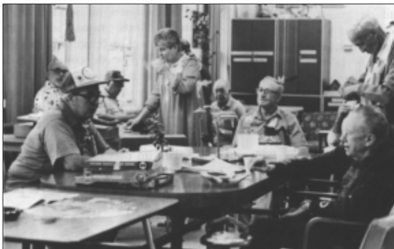
STE. ANNE'S HOSPITAL, JULY 1984.

The Tomb of the Unknown Soldier is located next to the National War Memorial and contains the remains of an unknown Canadian First World War soldier who was exhumed from a cemetery near Vimy Ridge. The Tomb and its Unknown Soldier represents all Canadians, whether they be navy, army, air force or merchant marine, who died or may die for their country in all conflicts - past, present, and future.