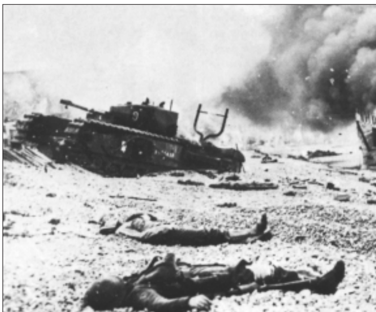
THE DIEPPE RAID, AUGUST 1942.

During the Second World War, Canadians fought valiantly on battlefronts around the world. More than one million men and women enlisted in the navy, the army and the air force. They were prepared to face any ordeal for the sake of freedom.