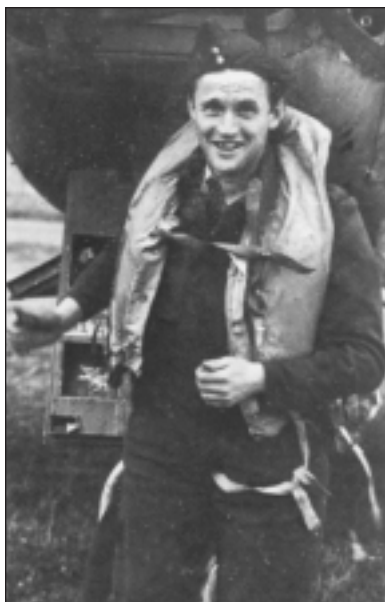
AN AIRMAN PRIOR TO THE DIEPPE RAID.

Those who came forward had not stopped to count the cost, for the excitement was thrilling, the lottery alluring, and the cause glorious; but now that the confusion was passed, and the fulfilment of vows alone remained to be faced, things took on a more sombre aspect .... 4