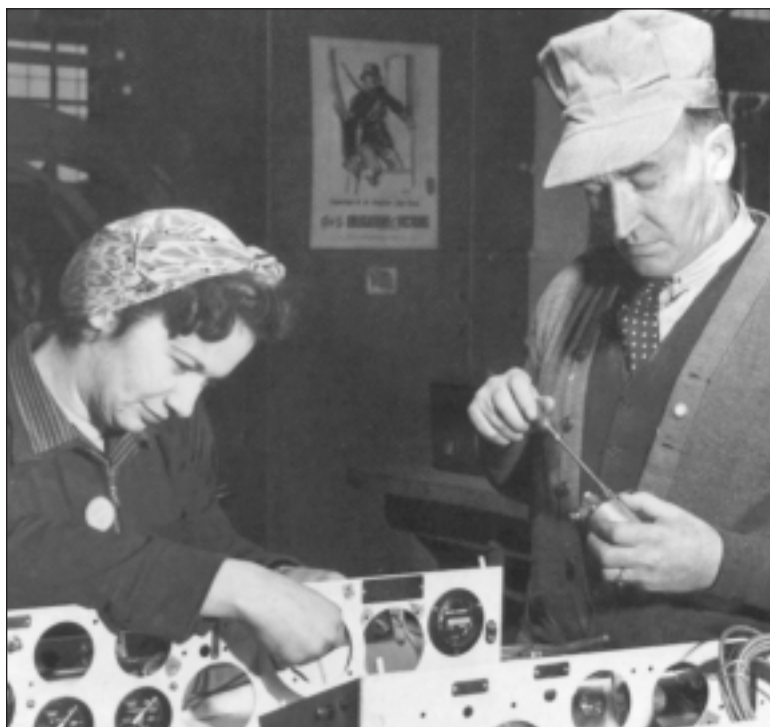
WORKERS ASSEMBLING INSTRUMENT PANELS FOR “RAM” TANKS, JULY 1942.

When will it all end? The idiocy and the tension, the dying of young men, the destruction of homes, of cities, starvation, exhaustion, disease, children parentless and lost, cages full of shivering, starving prisoners, long lines of civilians plodding through mud, the endless pounding of the battle-line. 5