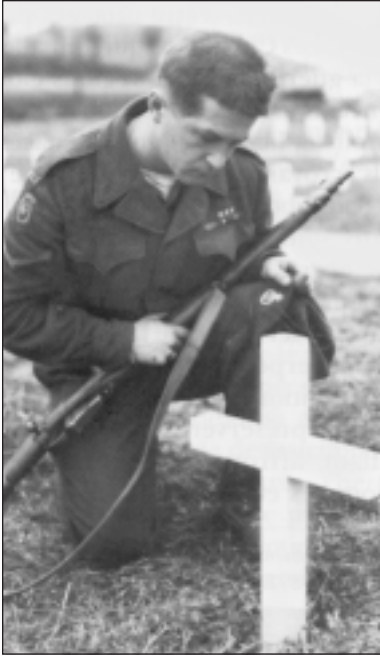
A CANADIAN SOLDIER KNEELS AT GRAVE OF FALLEN COMRADE IN THE UNITED NATIONS CEMETERY, KOREA. APRIL 1951. (NATIONAL ARCHIVES OF CANADA PA 128813)

These wars touched the lives of Canadians of all ages, all races, all social classes. Fathers, sons, daughters, sweethearts: they were killed in action, they were wounded, and thousands who returned were forced to live the rest of their lives with the physical and mental scars of war. The people who stayed in Canada also served - in factories, in voluntary service organizations, wherever they were needed.