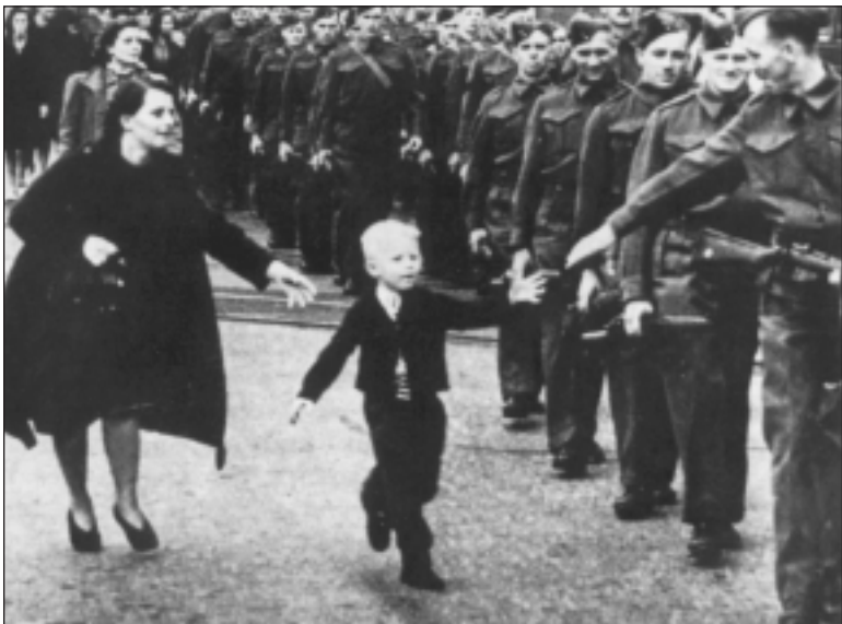
CANADIANS DEPARTING FOR ACTIVE SERVICE IN EUROPE DURING THE SECOND WORLD WAR, 1940.

By remembering their service and their sacrifice, we recognize the tradition of freedom these men and women fought to preserve. They believed that their actions in the present would make a significant difference for the future, but it is up to us to ensure that their dream of peace is realized. On Remembrance Day, we acknowledge the courage and sacrifice of those who served their country and acknowledge our responsibility to work for the peace they fought hard to achieve.