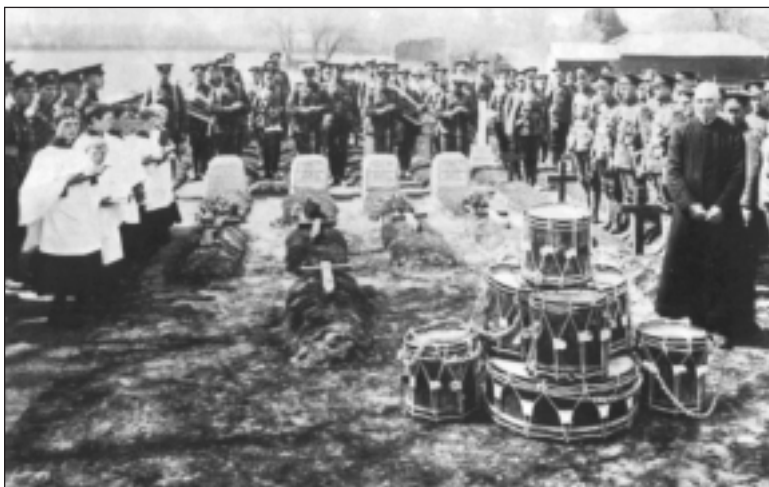
FUNERAL SERVICE FOR CANADIANS AT BRAMSHOTT DURING THE FIRST WORLD WAR.

During times of war, individual acts of heroism occur frequently; only a few are ever recorded and receive official recognition. By remembering all who have served, we recognize their willingly-endured hardships and fears, taken upon themselves so that we could live in peace.