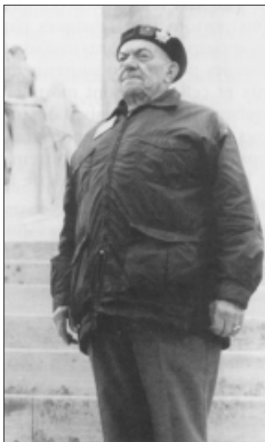
FIRST WORLD WAR VETERAN AT BASE OF VIMY MEMORIAL WHERE 11,285 NAMES ARE INSCRIBED IN THE STONE.

The two minutes of silence provide another significant way of remembering wartime while thinking of peace. Two minutes are scarcely enough time for thought and reflection. As we pause and bow our heads, we remember those brave men and women who courageously volunteered for the cause of freedom and peace.