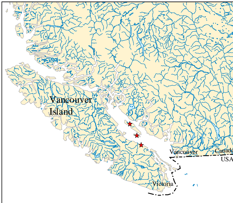
Figure 2. Map of southwestern British Columbia with historic distribution of stickleback species pairs indicated by red stars (upper: Texada Island, middle: Lasqueti Island, lower: Vancouver Island). These three locations are the only known sites to have had species pairs. Within the last decade the species pair on Lasqueti Island has been declared extinct, and the species pair in Enos Lake has collapsed into a single hybrid swarm.

A captive breeding program is underway at UBC in an attempt to recover “pure” limnetics and benthics from the population in Murdo-Frazer Park and the hybrid swarm in Enos Lake. The ultimate success of this program is uncertain.