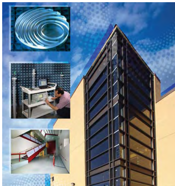
Images of CRC's new Photonics Laboratory and Research in Advanced Antenna Technology Laboratory (RAATLab).

Most recently, CRC patented the ultrafast IR laser technique for Bragg grating inscription, which induces photosensitivity in any transparent optical material. This new technology promises to expand the application of Bragg gratings into crystalline materials for nonlinear optical switches, high-power fibre lasers and high temperature fibre-optic sensors.