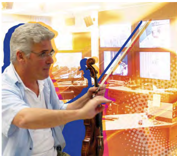
Pinchas Zuckerman connected with violin students in Finland using broadband technology in CRC's BADLAB.

tool while enabling students from a music academy in Finland to receive violin instruction from Pinchas Zuckerman, Music Director for Canada's National Arts Centre (NAC) Orchestra.