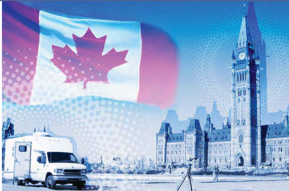
CRC equipment set up for testing broadcast signals on Parliament Hill, where CRC executives recently advised the Canadian Heritage Committee on the future of broadcasting technologies.