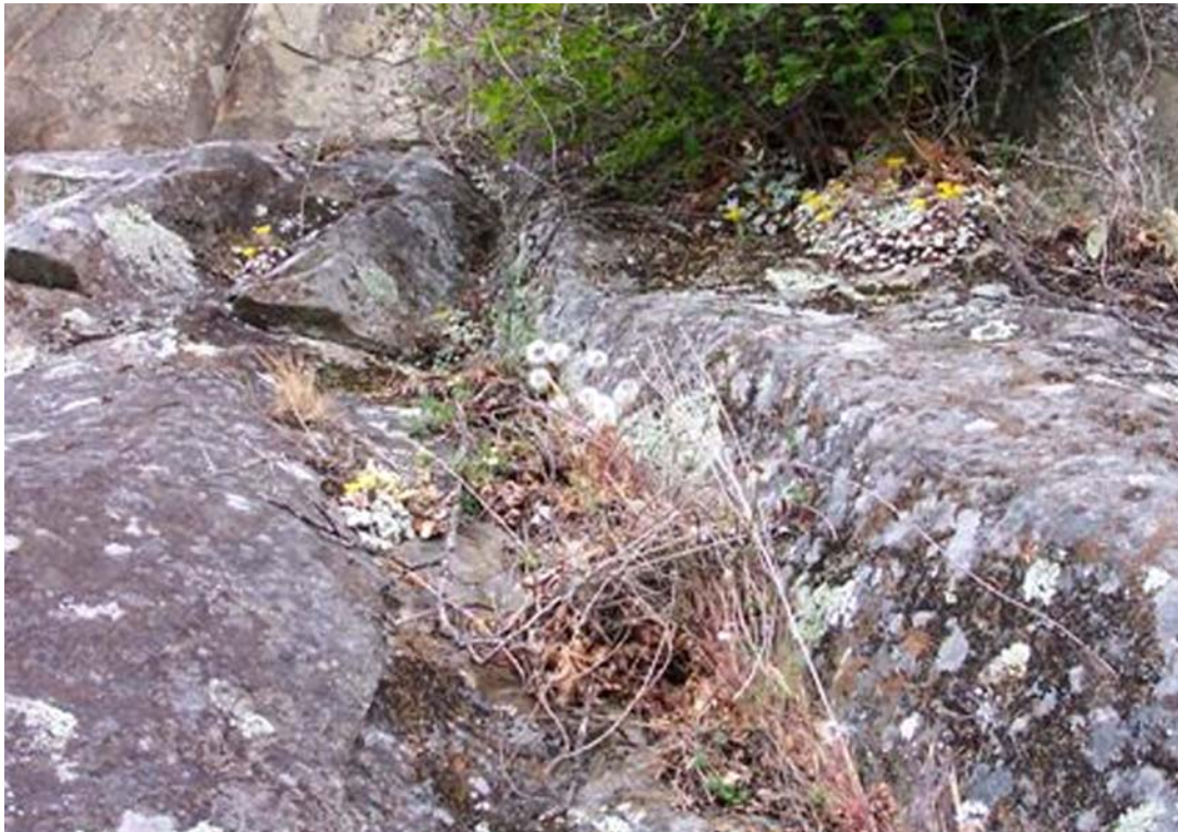
Figure 5. Uropappus lindleyi on sandstone cliffs on Saturna Island. Whitish fluffy round fruiting heads are visible at middle centre of photo.

The species occurs on sandstone cliffs and steep grassy slopes, and xeric, open deciduous or evergreen forests within the CDF zone. On sandstone cliffs, the plants grow in cracks and on ledges (Figure 5). The few plants growing with U. lindleyi on these cliffs include Alaska brome ( Bromus sitchensis ), great camas ( Camassia leichtlinii ), American wild carrot ( Daucus pusillus ) and Pacific stonecrop ( Sedum spathulifolium ). The steep, grassy slopes are occupied mainly by alien species such as early hairgrass ( Aira praecox ), ripgut brome ( Bromus rigidus ), barren brome ( B. sterilis ), and Scotch broom ( Cytisus scoparius ).