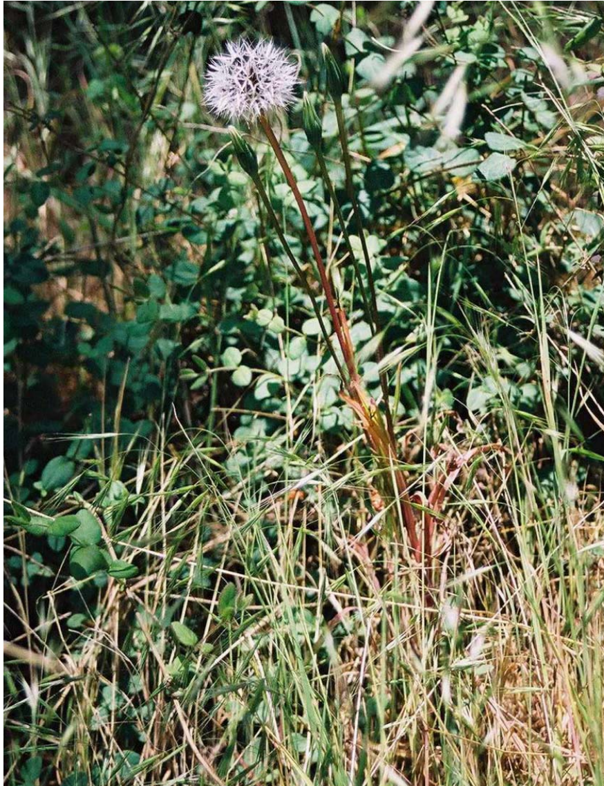
Figure 2. Uropappus lindleyi in seed on Galiano Island, British Columbia. A plant with one large, round mature fruiting head is present in centre of photo.

several researchers suggesting that this species be reclassified as Uropappus lindleyi (Battjes et al. 1994, Jansen et al. 1991, Wallace and Jansen 1990). It is now treated as Uropappus lindleyi in Flora North America (Chambers 2006).