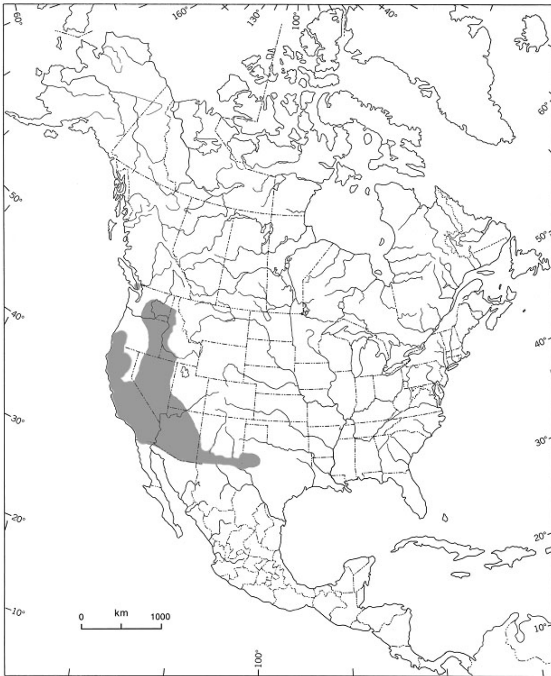
Figure 3. Distribution of Uropappus lindleyi in North America (based on USDA, NRCS 2007).