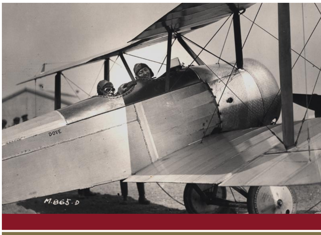
Major William George Barker in his most comfortable location, inside an airplane.

down another aircraft. Utterly exhausted by this point and severely wounded, Barker escaped, crashing his aircraft. During the mission he had raised his personal total of aircraft destroyed to 50.