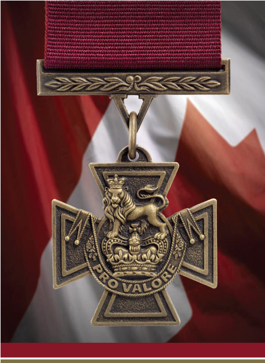
The first Victoria Cross produced in Canada.