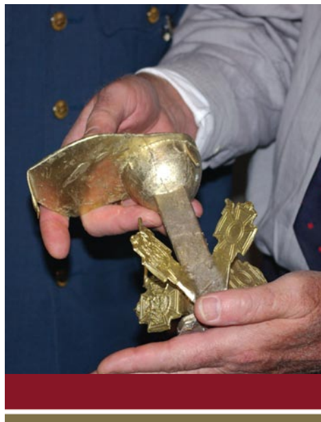
The casting tree after demoulding with four Victoria Crosses still attached.