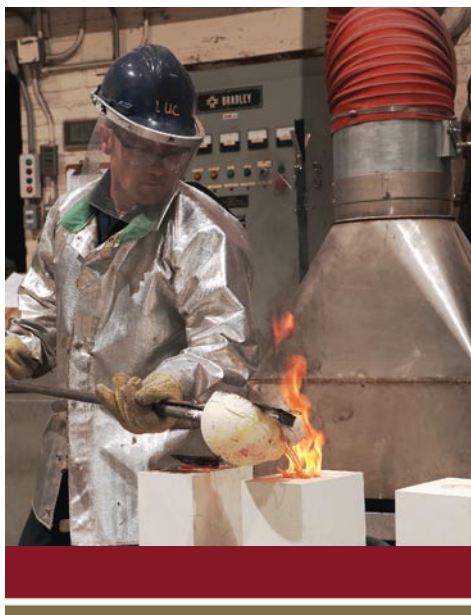
The second stage of casting when the alloy was poured into the moulds to create the Victoria Cross insignia.