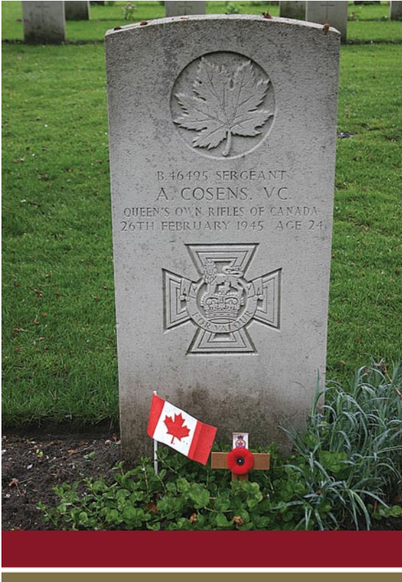
The headstone for Sergeant Aubrey Cosens in Groesbeek Canadian War Cemetery in the Netherlands.