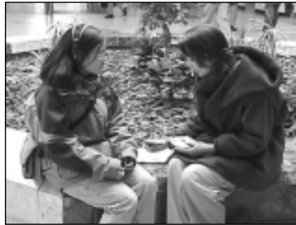
One of the researchers interviews a shopper about fire alarm recognition.

Members of the public were approached in buildings such as