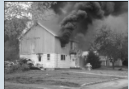
A house goes up in flames in Kemanó, B.C. in aid of fire research.

An entire Canadian town has gone up in flames, and IRC was on hand to take full advantage of the smoke, flames, and research opportunities. The lessons learned there could help protect Canadians from fire for years to come.