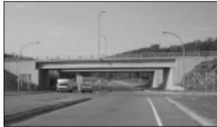
Federal, provincial and municipal governments have to manage a broad range of infrastructure assets, including roadways and bridges.