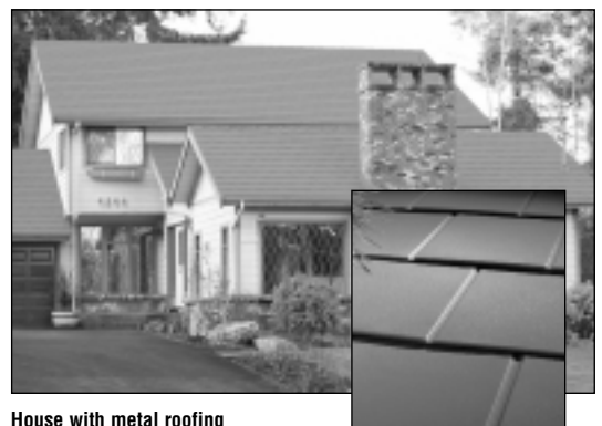
House with metal roofing

CCMC has been approached by several manufacturers of these products, who are aiming at life expectancies much greater than