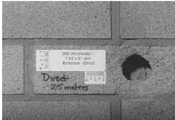
Figure 3 - Damage to clay brick caused by .308 Winchester

The .308 Winchester bullet produced a chip approximate 80 mm wide by 55 mm high from the brick. In addition, a 35 mm diameter hole was produced to a depth of about two thirds the brick thickness. The mortar was cracked around the perimeter of the brick. Figure 3 shows the damage caused by the .308 bullet.