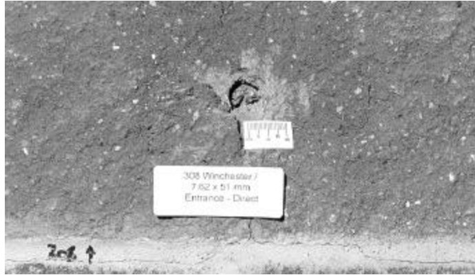
Figure 5 - Damage to red concrete masonry units caused by .308 Winchester