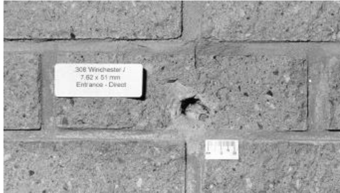
Figure 4 - Damage to concrete brick caused by .308 Winchester