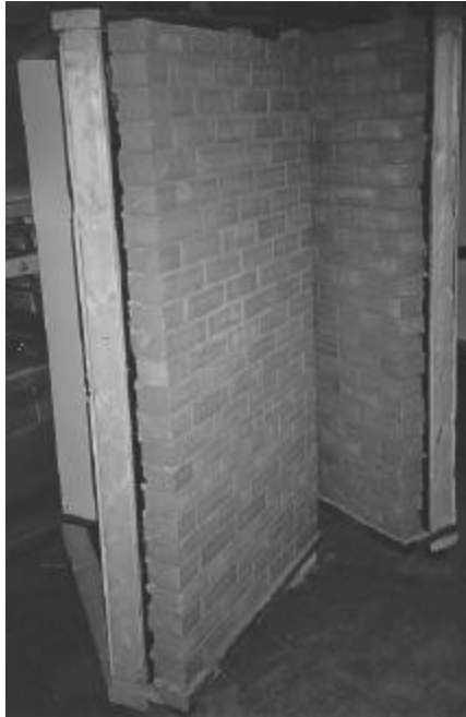
Figure 1 - Concrete Brick with Wood Stud Backup Wall Specimens