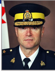
Pierre-Yves Bourduas Deputy Commissioner Federal Services and Central Region