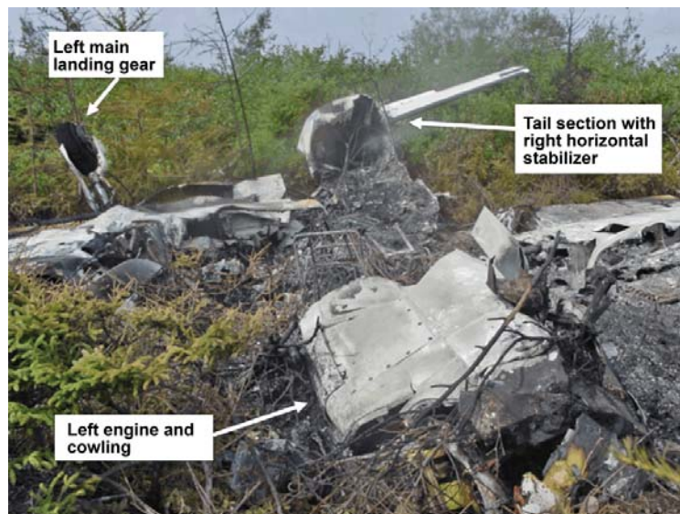
Figure 2. Aircraft wreckage

The aircraft continued forward, eventually rolling over and coming to rest inverted 650 feet southeast of the localizer. The wreckage trail was approximately 110 feet long. The cockpit and cabin were not initially compromised. A fuel-fed fire broke out a few seconds after the aircraft came to rest (Figure 2). The fire was well developed by the time the two pilots exited through the aft cabin door. The fire consumed about 90 per cent of the fuselage. Both wings sustained severe fire damage, but the empennage remained relatively undamaged.