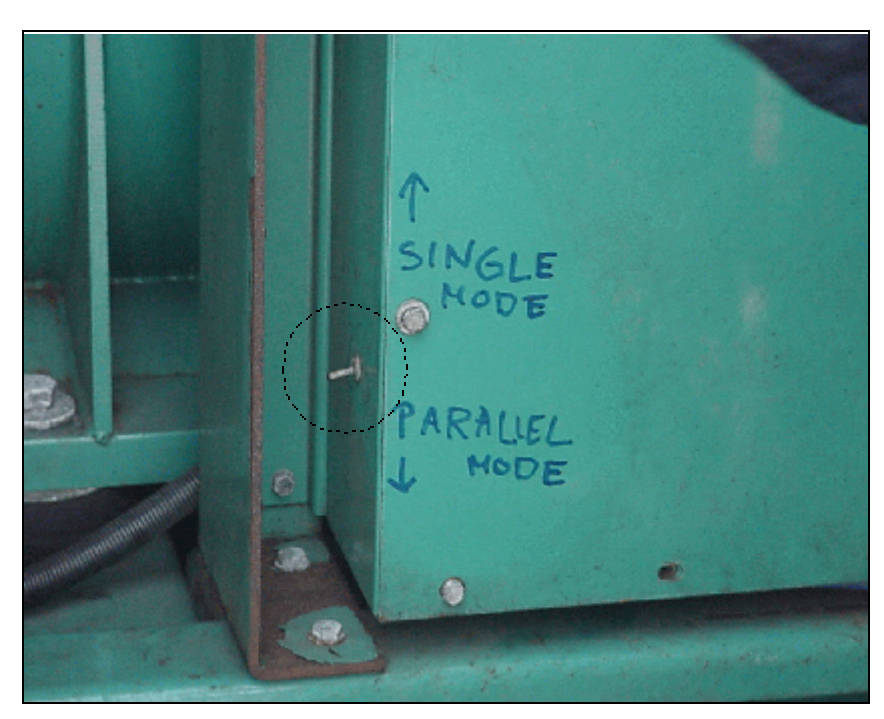
Figure 1 - Toggle switch mounted on temporary genset control panel

The temporary generator was a containerized Onan, model DFHD 60. manufactured by Cummins Power Generation. It comprised a Cummins diesel engine driving an Onan single bearing alternator. The selfcontained unit is equipped with a fully-integrated Power Command Control (PCC) microprocessorbased system, used for monitoring, metering, governing, and voltage regulation. The PCC manages a parallelling function, however by use of a bypass switch on the generator, it is possible to override the PCC system