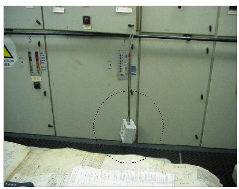
Figure 2 - Arrangement of the temporary potentiometer on main switchboard

On the vessel's subsequent return to Liverpool on 26 April 2001, additional load and control cables were installed by a shore-based service engineer. This allowed the temporary genset to run at its maximum capacity of 900 kW. As the genset was still not capable of automatically sharing electrical load when running in parallel with the other SSGs, a potentiometer was installed on the main switchboard (see Figure 2). which allowed the crew to balance the load by controlling the genset's governor manually. Parallel tests up to 700 kW were conducted. A written procedure, detailing both stand-