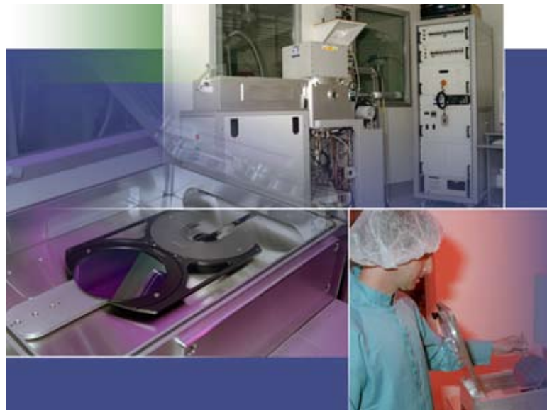
Wafer processing in the Advanced Plasma Technology Lab at the Communications Research Centre (CRC).