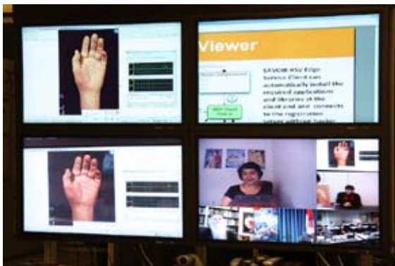
When the HSVO team met in CRC's BADLAB in October, some partners joined by video conference (lower right). Images of a specimen hand appear on the BADLAB screens to the left.

Ontario School of Medicine (NOSM) and McGill University, the project brings together NOSM and McGill with Stanford and Lakehead Universities; the Communications Research Centre and National Research Council; iDeal Consulting and Innovation in Learning, Inc. CANARIE Inc. is Canada's advanced network organization and is supported by membership fees, with major funding of its programs and activities provided by the federal government through Industry Canada.