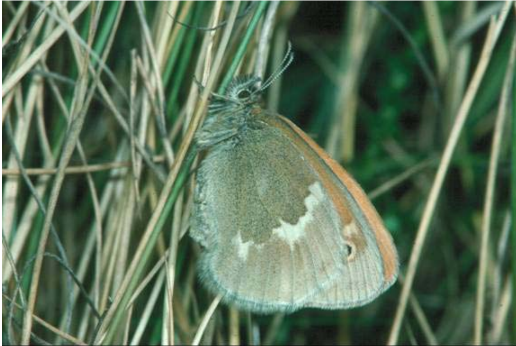
Figure 2. Female Maritime Ringlet.