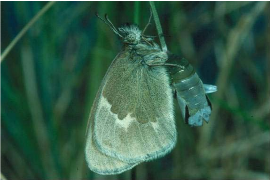
Figure 1. Male Maritime Ringlet recently emerged from chrysalis.

The upperside of males is usually dark ochre to ochre-brown which often shades to a smoky brown along the outer half of the margins of the front wing and on nearly the entire upper hind wing (Figure 1). The fringes are deep smoky brown on the front wing becoming progressively paler below the apex of the hind wing. The underside of the front wing is dark ochre shaded with grey apically and narrowly along the costa and margin toward the anal angle. There is a prominent creamy oblique band on the underside of the front wing and an apical eyespot is present in about 30% of the males. The eyespot (ocellus) sometimes appears on the upperside of the front wing as a dark spot with a lighter halo. The basal portion of the underside of the hindwing is dark brown, often becoming progressively suffused with grey towards the margin. The grey often has an olivaceous cast. There is a prominent irregular shaped cream coloured median band and traces of a diffuse brown marginal band on the underside of the hind wing. As males lose scales with age, they become progressively darker. The wing-span is 32-34 mm. Females exhibit the same maculation but are more ochre coloured than males (Figure 2). The apical ocellus is often better developed and is present in over 90% of the females. The wingspan is 33-36 mm.