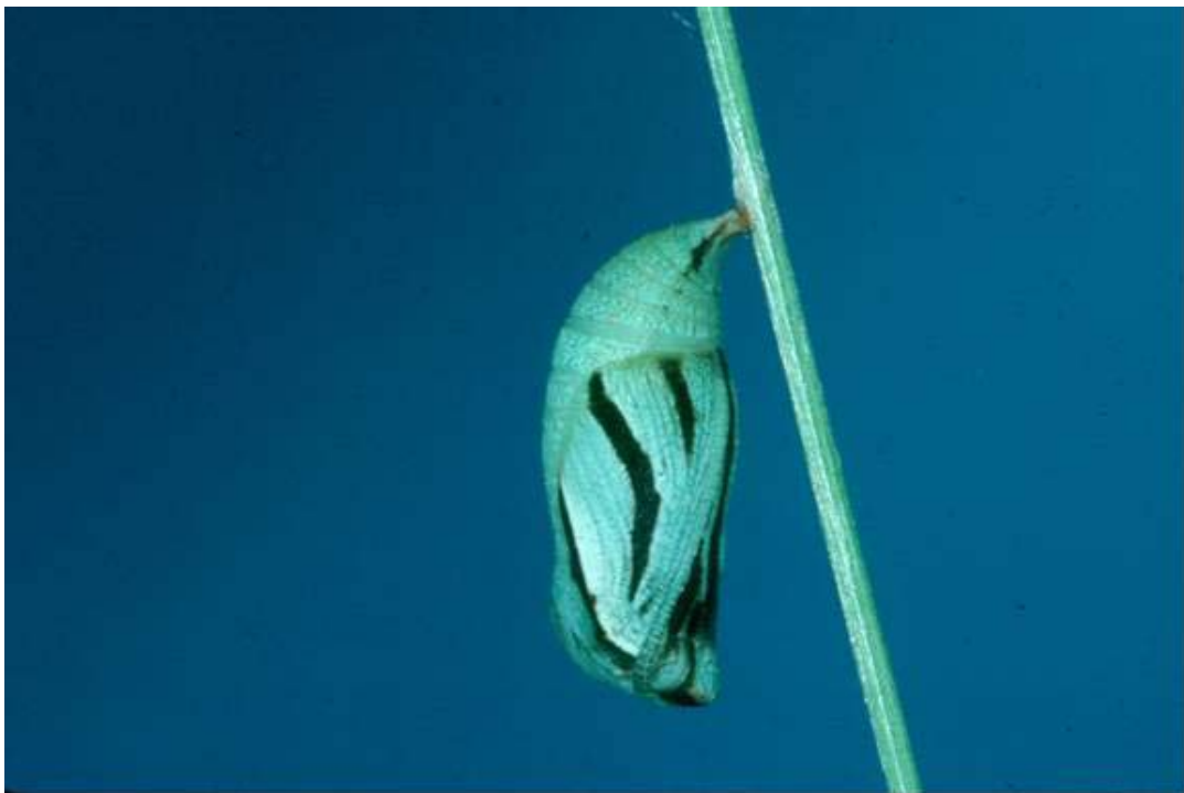
Figure 4. Chrysalis (pupa) of Maritime Ringlet.