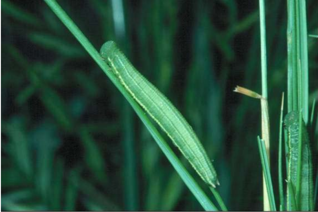
Figure 3. Last instar larva of Maritime Ringlet.