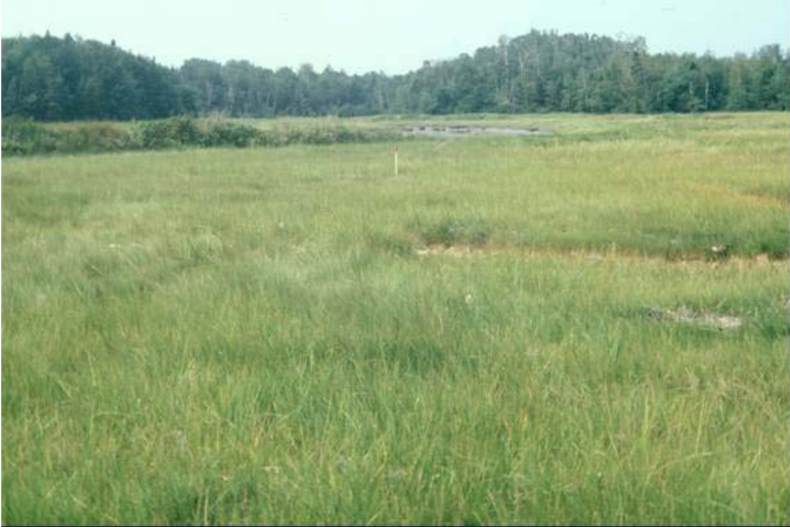
Figure 6. Salt marsh (Estuary of Peters River) inhabited by Maritime Ringlet.