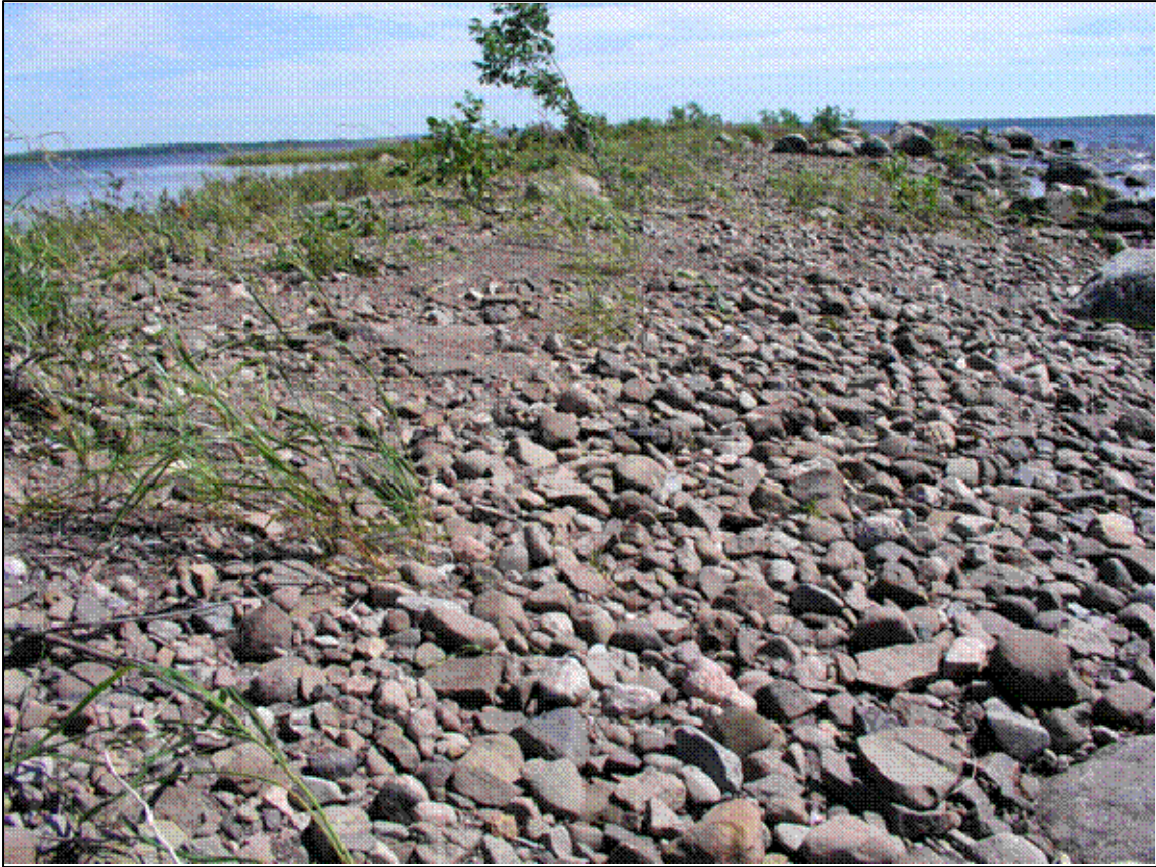
Figure 6. Cobblestone beach on the shores of Grand Lake.