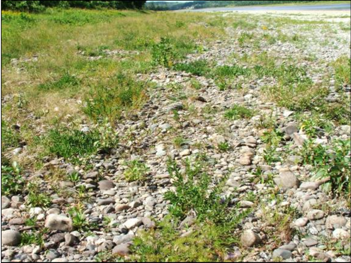
Figure 7. Cobblestone beach on an island on the Saint John River.

Adults were generally not found on river margin habitats in New Brunswick (but see below). Most river margin habitats are covered by relatively dense vegetation during the summer and appear to be unsuitable for C. marginipennis in being without extensive open cobble. It appears that the flow patterns created by the islands during flooding may be required to create the micro-habitat conditions required for the long-term survival of this rare species. However, in 2007, several individuals of C. marginipennis were observed on a small section of cobblestone beach river margin opposite an island occupied by this species (Webster, unpublished). At this previously known site, the adults occurred adjacent to the river on a relatively small access road to the river constructed within the past three years. Apparently construction of the road created the relatively vegetation-free conditions required by the beetle.