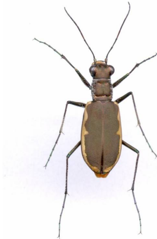
Figure 1. Adult Cicindela marginipennis , dorsal view.

C. marginipennis adults are 11-14 mm in length and like all tiger beetles have large mandibles used to capture their prey. Adults have a narrow continuous cream-coloured border along the elytra (Figure 1) and a bright red-orange abdomen (dorsal and ventral sides) that is clearly visible during flight (Figure 2).