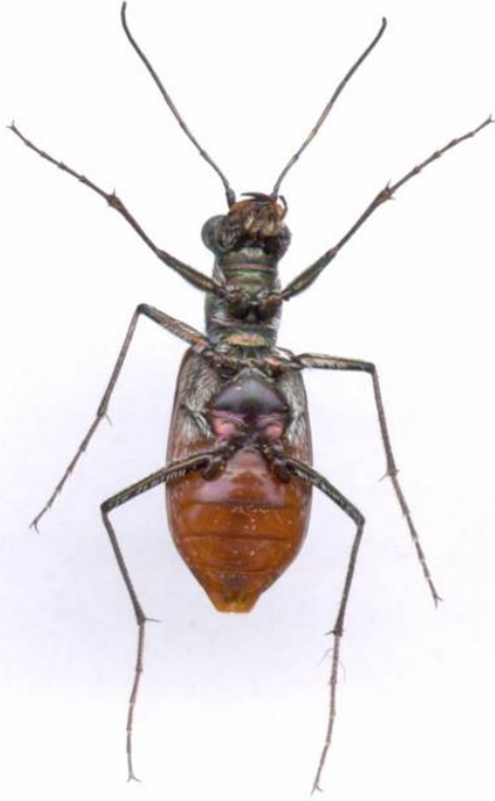
Figure 2. Adult Cicindela marginipennis , ventral view.