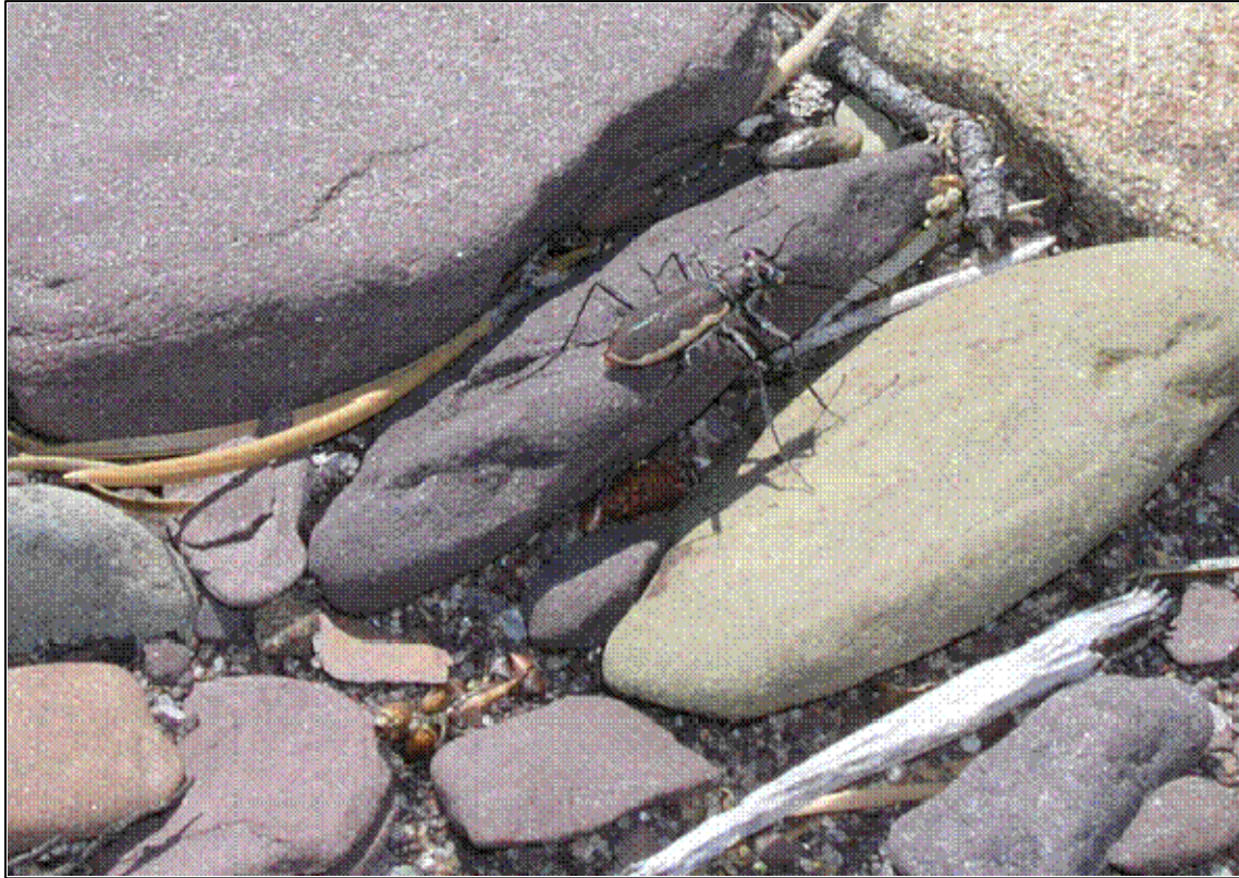
Figure 3. Adult Cicindela marginipennis in natural habitat at Grand Lake.