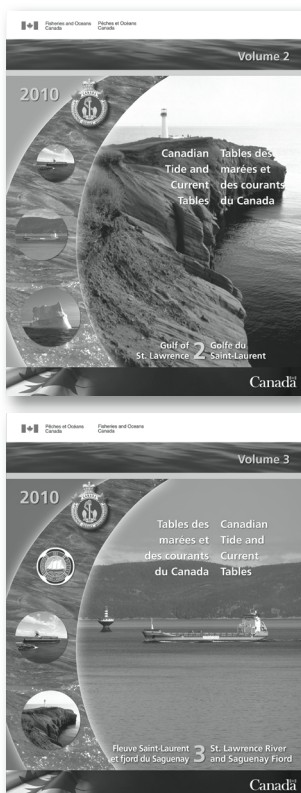
Robert Dorais Science

Copies of the Canadian Tide and Current Tables can be purchased from authorized dealers. For more information about tides and water levels, consult the Web site at www.tides.gc.ca or call 1-877-775-0790.