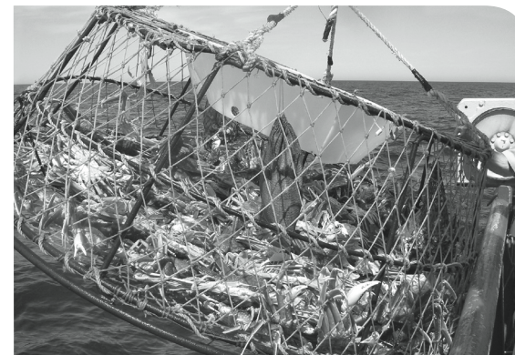
DFO R. BOURGEOIS

In terms of value, the top five exported species by Canadian industries were lobster, snow crab, Atlantic salmon, shrimp and herring. These species accounted for 49 percent of the volume and 63 percent of the value of all seafood product exports. Lobster continues to be the exported species that generates the greatest value in Canada with exports totalling $800 million in 2009.