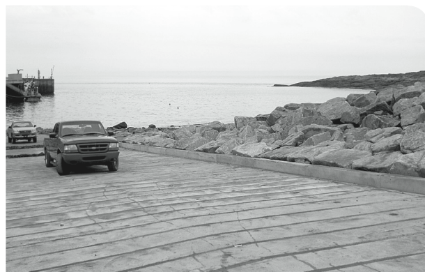
GENIVAR G. BOUCHARD

The existing ramp used to launch fishing boats at Les Escoumins had been in poor condition for several years. It was located in an area subject to strong erosion and relatively far from fishing activities. A new ramp with a 7 m drop was built in spring 2010 near the fishers' pontoons in Anse aux Basques. The new ramp is composed of 30 prefabricated embedded concrete slabs, making the structure very solid and long-lasting.