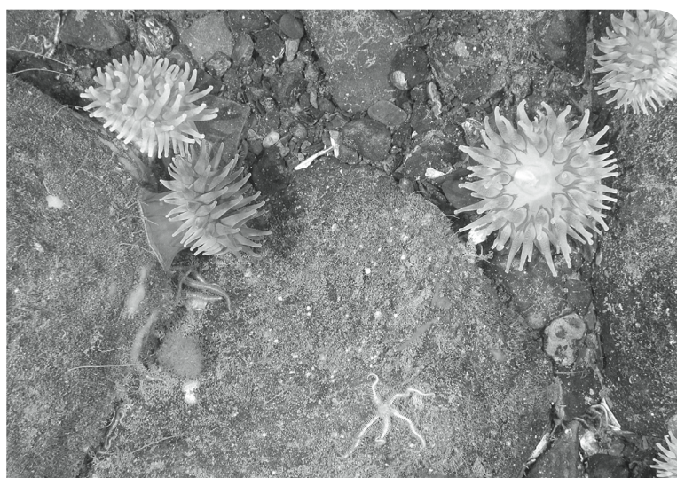
Photo of seabed taken 83 m below the surface north of Île Verte