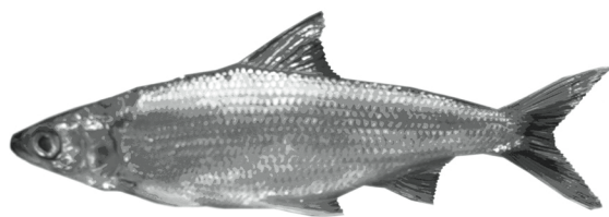
MRNF M. HÉNAULT

Lac des Écorces has experienced numerous disturbances for over 50 years. Human presence has intensified since the 1970s as new areas on the shores of the lake have gradually opened to housing (principal and secondary residences). In addition, the lake has been stocked with fish of many species in order to promote recreational fishing. The Rainbow Smelt's recent colonization of the lake, observed in 1999, appears to have become the main threat to the Spring Cisco's recovery.