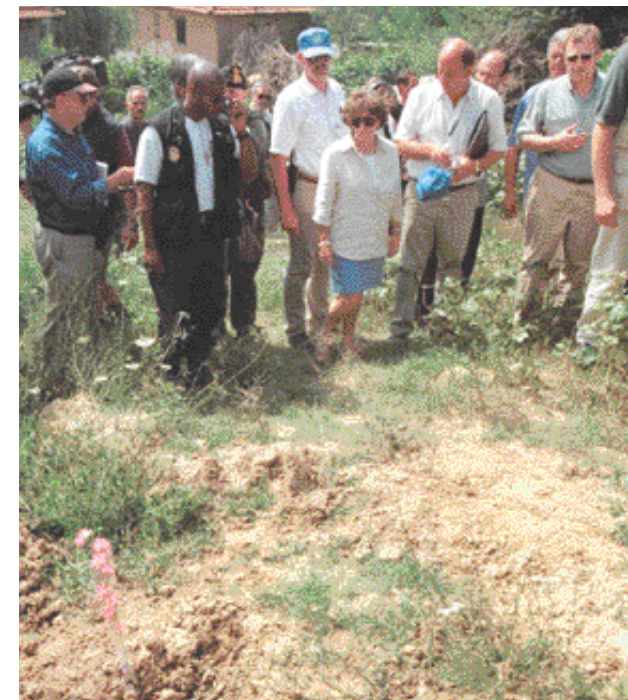
Louise Arbour, centre, and team of forensic experts stop at the grave of a teenage girl allegedly executed by Serb forces in the village of Celine, in Kosovo.