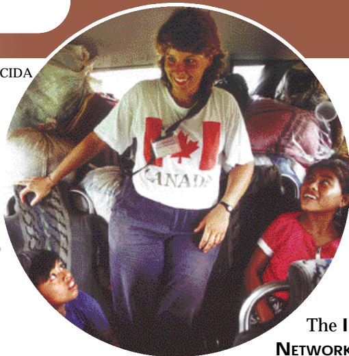
The INTERNATIONAL ACTION NETWORK ON SMALL ARMS