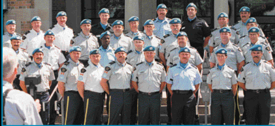
The first Canadian Civilian Police contingent on the eve of departure for Kosovo, July 30

After conflicts are over, military peacekeepers come into action to maintain peace, usually under the flag of the United Nations. In recent years however, the demand for civilian police has been growing as peace operations have expanded to assist in the return to civil society.