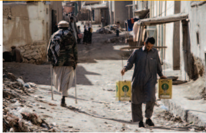
Kabul street: responding to the humanitarian and reconstruction needs of the Afghan people is critical.