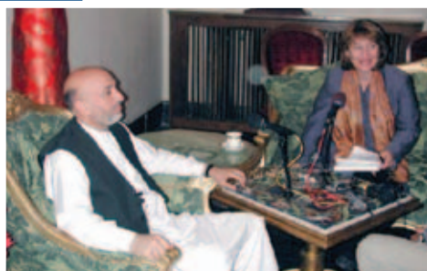
Anna Maria Tremonti in conversation with Afghan President Hamid Karzai.