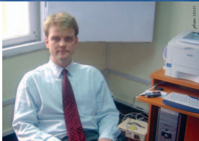
Ambassador Christopher Alexander in his modest but functional Kabul office.

That experience stands him in good stead in Kabul, where his role is not only to break down barriers between Afghans, but also to coordinate the activities of Canadians working in the country. And there is no shortage of coordinating to do. "Our soldiers are all around us," Mr. Alexander