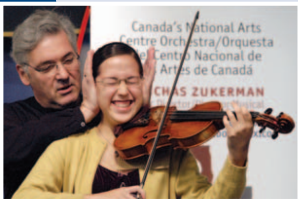
Master class: Pinchas Zukerman teaches on tour in Monterrey, Mexico.

In Monterrey, the orchestra presented innovative educational activities using Internet video conferencing technology. Schools in Canada, the U.S. and Mexico were linked through the NAC's next-generation Internet facility. Orchestra members also posted diary entries in Web journals on the NAC's highly successful youth Web site, www.ArtsAlive.ca . 🍁