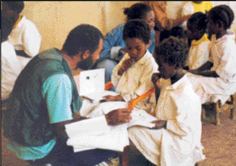
Interviewers administer a pictorial questionnaire to children in Huila province, Angola, as part of CIETCanada's evaluation of mine awareness education in that country.