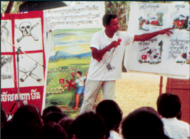
A mine awareness educator in Cambodia teaches a community about the dangers of anti-personnel mines.

UNICEF is the United Nations agency taking the lead on mine awareness education. It plays an important role in the direct delivery of mine awareness education. In addition, it has developed the International Guidelines for Landmine and Unexploded Ordnance Awareness Education , a manual for international donors and mine awareness providers.