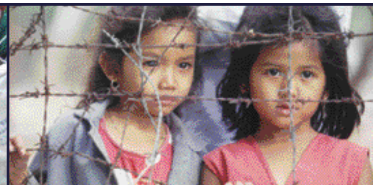
Two Vietnamese girls at the Sikhui refugee camp in Nakorn Ratchasima, northeast of Bangkok, Thailand