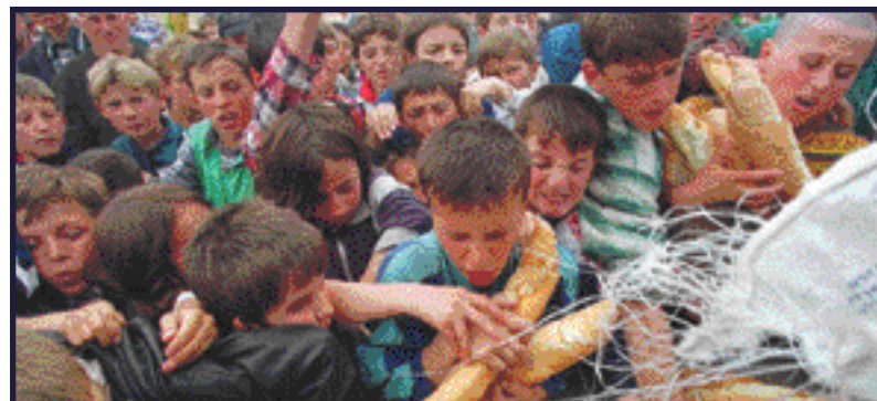
Ethnic Albanian refugees from Kosovo, including children, struggle for loaves of bread near a refugee camp in Kukes, Albania, May 1999.

The problem is enormous but I am convinced it can be solved so that every child has a fighting chance to determine how he or she will live.