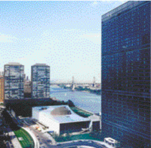
UN headquarters in New York City, site of the Special Session on Children

Millions of children lead safer, healthier, fuller lives than a decade ago, but the rights of too many children and women are abused or threatened. The challenge is to find practical solutions to these problems and to commit the necessary human and economic resources. The Special Session is expected to produce a Global Agenda with a set of goals, and a Plan of Action for ensuring that children have the best possible start in life.