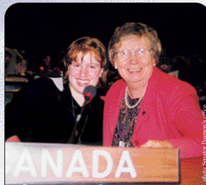
Senator Pearson with a young Canadian delegate at a Special Session Preparatory Committee meeting in June 2001 in New York

In 1999, when Prime Minister Chrétien appointed Senator Landon Pearson his Personal Representative to the UN General Assembly's 2001 Special Session on Children, the choice came as no surprise. For over 40 years Landon Pearson has been a champion of children in Canada and abroad (see profile in Canada World View , Issue 9, fall 2000). She has forceful views on the international community's record on safeguarding children, and strong ideas on what the Special Session should accomplish.