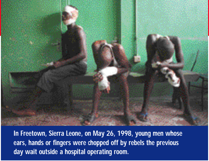
In Freetown, Sierra Leone, on May 26, 1998, young men whose ears, hands or fingers were chopped off by rebels the previous day wait outside a hospital operating room.