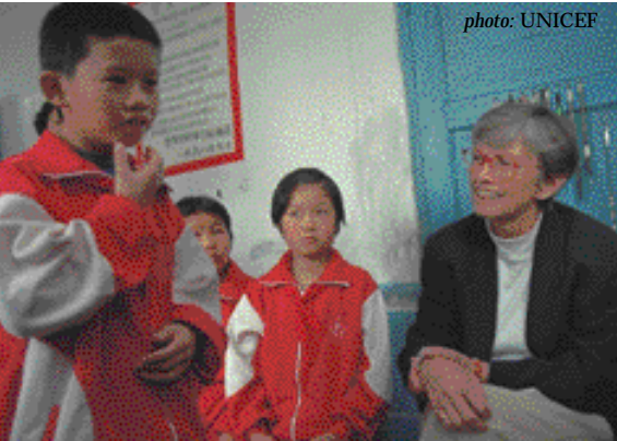
Carol Bellamy with schoolchildren in China

Ms. Bellamy It is vitally important that the Special Session galvanize the leadership, political will, commitment and resources to address these challenges. Experience shows that the difficulties are not insurmountable. If intention and determination are in place, we have