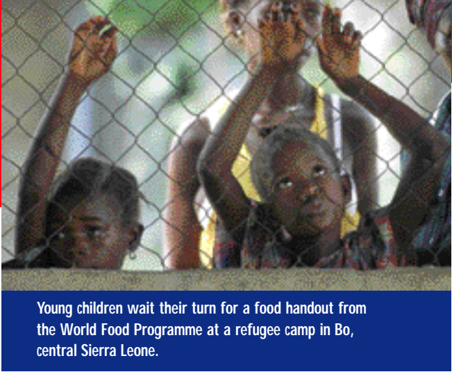
Young children wait their turn for a food handout from the World Food Programme at a refugee camp in Bo, central Sierra Leone.

For more information about the Human Security Program, visit: http://www.dfait-maeci.gc.ca/foreignp/humansecurity/menu-e.asp