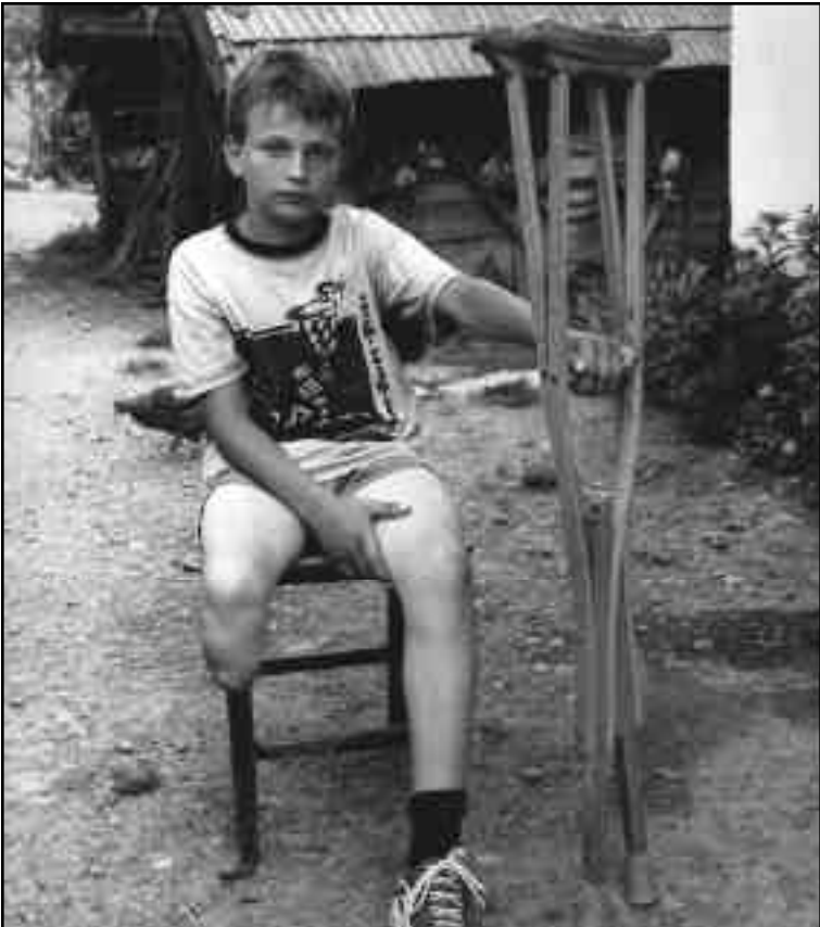
Years after a conflict has ended, anti-personnel mines continue to indiscriminately harm civilians, such as this Bosnian boy. Successful mine awareness education programs can significantly reduce the likelihood of a child's injury or death in an AP mine accident.

In general young men suffer the highest rates of injury and death caused by AP mines, but children are perhaps the weapons' most vulnerable targets. Children are liable to touch and play with objects that appear interesting, including mines and unexploded ordnance. Some mines are particularly enticing—for instance, the colourful PFMN-1 butterfly mine, dropped in vast quantities from aircraft over Afghanistan. Mine accidents often injure children more severely than adults because their relatively small stature places them closer to the ground and hence to the point where a mine explodes. If a growing child loses a limb to an AP mine blast, the prosthetic will have to be replaced far more frequently than in the case of an adult. Often the cost is prohibitive and prosthetics of good quality are unavailable.