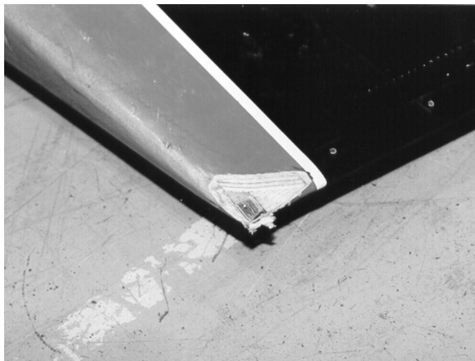
Figure 2 - Scrape mark on bottom of right wing tip