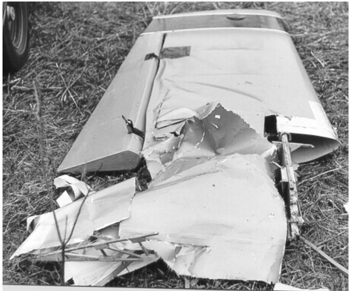
Figure 1 - Separated section of right wing

The main wreckage was located two miles south of the airport and the separated section of the right wing was 3 000 feet north of the main wreckage, resting above the ground in brush type trees. The right wing main spar separated from the aircraft 97 inches in from the wing tip, and the rear spar separated 56 inches in from the wing tip. The front spar had fractured in one location and the rear spar in three locations. There was no sign of rubbing on the surfaces of any of the spar fractures. The bottom surface of the trailing edge of the right wing tip was ground down through two layers of wood. The ground-off surface had a fresh appearance and was free of dirt or debris.