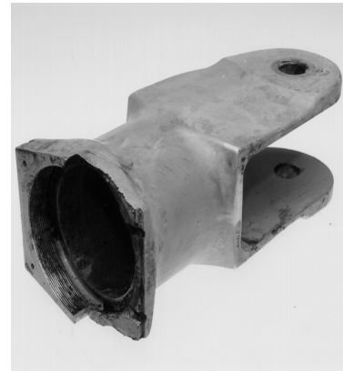
Figure 1 - Failed Blade Grip