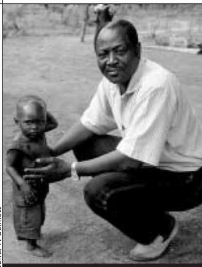
Development organizations are under constant pressure to demonstrate that their programs improve the well-being of their intended beneficiaries.