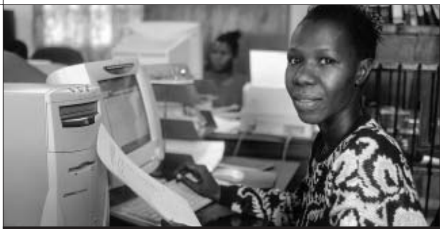
The demand from African policymakers for information, research, and analysis on the use of ICTs as tools to accelerate growth is increasing.

University of Denmark, and the London School of Economics: LINK is the first African university to join the network.