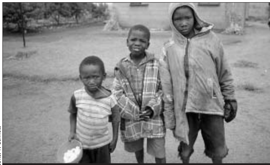
IDRC: P. Bennett

Objective: To examine the current state of the peacebuilding and reconstruction field and explore new avenues for research and policy.