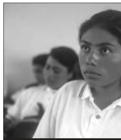
There is growing interest on the part of Canadian, Latin American, and Caribbean researchers for stronger partnerships among themselves.

Looking ahead: Sixteen travel-support grants, each a maximum of $6 500, will be awarded in 2003. AUCC and IDRC will strengthen and broaden the scope of existing interactions between Canadian and Latin American researchers.