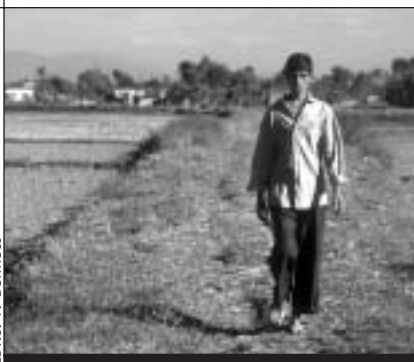
Projects are isolated because of poor connectivity in much of rural Asia and the Pacific.

Objective: To strengthen the capacity of Hondurans to plan and implement development projects and policies that address the needs of the poor and other vulnerable populations.