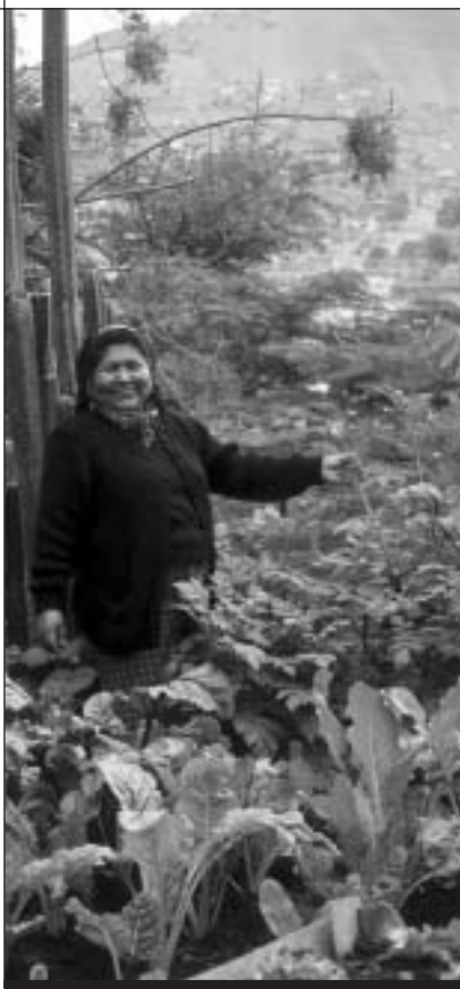
In Latin America, most municipalities lack information about how best to promote and implement urban agriculture programs.

reuse of waste water to gender considerations. The draft briefs were validated by urban farmers, government representatives, and the private sector through local and regional workshops in 15 municipalities and a regional consultation in Peru in September 2002. In the process, the capacity of municipalities to formulate and implement urban agriculture policies was increased and partnerships were forged between research institutions and local governments, and between the municipalities themselves. The briefs have been published in Spanish, English, and French. The project, completed in March 2003, was cofinanced by IDRC, the Urban Management Programme — Regional Office for Latin America and the Caribbean of UN HABITAT (Ecuador), and IPES —