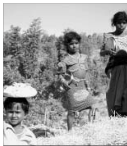
IDRC: S. Colvey

Context: The breakdown of traditional food-production systems is an important source of food insecurity among poor