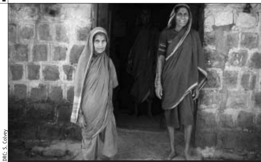
IDRC: S. Colvey

Objective: To explore issues surrounding land tenure and access to, and use of, natural resources in the inter-Andean valleys of Bolivia as the basis for formulating a policy agenda.