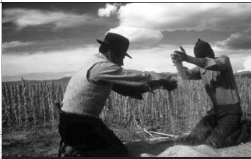
In the Andean region, more sustainable use of land, water, and forest resources is key to the future well-being of rural dwellers

Progress to date: A consortium of five Bolivian organizations, led by Fundación TIERRA in La Paz, Bolivia, documented and analyzed the impact of changes in land tenure on both rural men and women's access to natural resources in the inter-Andean valleys since the agrarian reform of 1952. The main findings are that, contrary to current cadastral law, the population wants and needs private and group titles to common pool resources, as well as private titles to individual parcels. These results have been disseminated to municipal authorities through workshops in all municipalities surveyed as they are key to implementing land reform. A dissemination document on the findings was produced in October 2002, and a book was published in February 2003. The project officially ended in November 2002.