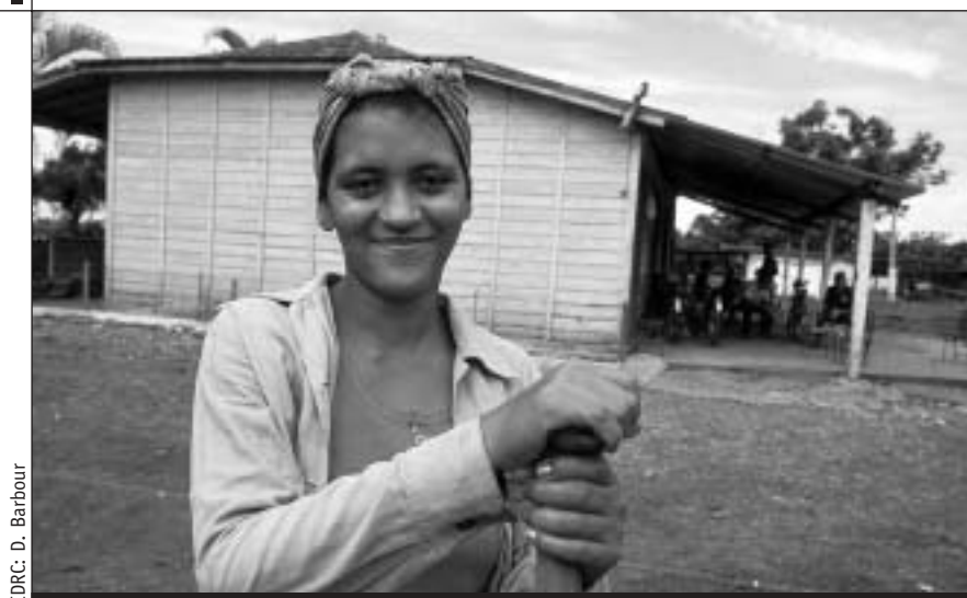
MercoNet's strong record has paved the way for the expansion of activities in collaboration with government officials, civil society, and international organizations.

Progress to date: Launched in December 2002, the project aims to develop an ICT policy research base in Africa, centred at the Learning Information Networking and Knowledge (LINK) Centre of Witwatersrand University in Johannesburg, South Africa. The project will strengthen LINK's research base, improve coordination and stimulate debate across the continent, and facilitate access to information by decision-makers, academics, and civil society organizations. The research agenda is being developed collaboratively and builds on other IDRC-supported initiatives in Africa. The continental network will be enhanced by the LINK's inclusion into the Learning Initiatives on Reforms for Network Economies (LIRNE.NET), an international collaboration between the Delft Universities of Technology, the Technical