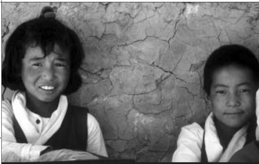
IDRC established the Peacebuilding and Reconstruction (PBR) program initiative to explore what contributions research could make to building a lasting peace in countries emerging from violent conflict.

Progress to date: In the course of carrying out or supporting research on challenges common to postwar situations, IDRC and its partners frequently asked an essential question: What kind of peace was being built? In early 2001, IDRC initiated a transnational discussion to explore this question more systematically. A workshop in September 2002 brought together some 40 partners and practitioners from the research, diplomacy, policymaking, and programming communities in the North and in the South to take stock of what has been achieved in postwar peacebuilding efforts and to look at how this is informing our thinking about broader peacebuilding, conflict prevention, and human security challenges.