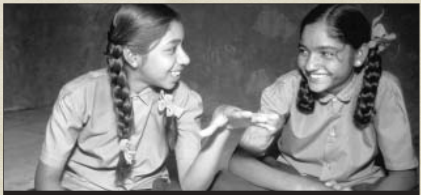
Donor partnerships are an integral part of the Centre's modus operandi — when they are consistent with the Centre's mandate and when they enhance program impact and reach for the benefit of IDRC's partners in the South.

Discussions are ongoing to understand clearly the impact this framework would have on the Centre's resource-expansion activities and to develop flexible strategies to ensure both efficiency and effectiveness.