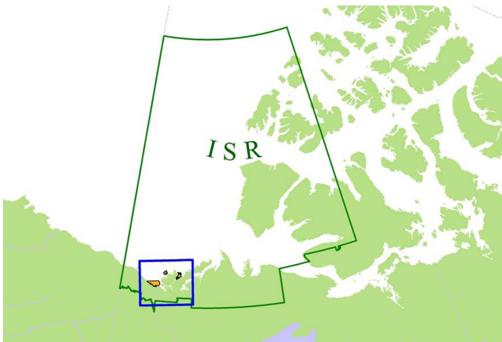
Figure 1. Inuvialuit Settlement Region (ISR) with Tarium Niryutait Marine Protected Area (Zone 1a beluga areas) shown inside box outline.

TNMPA sub-areas correspond to Zone 1a of the BSBMP (FJMC 2001). There is a wealth of traditional knowledge about the TNMPA and ISR that can be found in socio-economic reports produced by DFO Oceans Programs Division. This report has a marine aquatic science-based advisory focus and, for that reason, traditional knowledge is not included here.