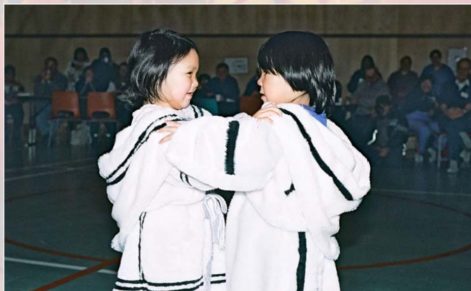
Throat Singers [Katajait]

A short school performance, 'Return of the Sun' ceremony by the Headstart and Ataguttaaluk Elementary students