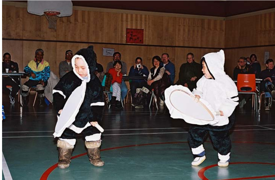
Drum Dancers [Aboriginal Headstart Program, Health Canada]