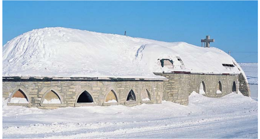
Old 'Stone' Church built by RC Missionaries