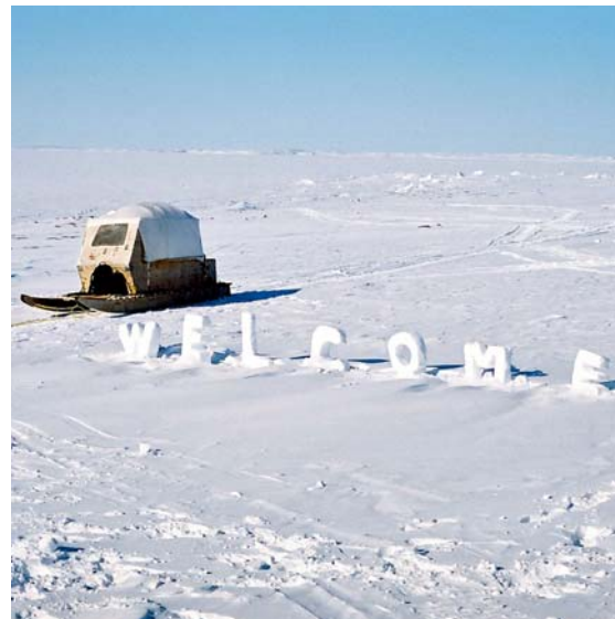
Two scenes from Avajja side trip