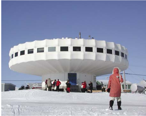
The Igloolik Research Centre where we met