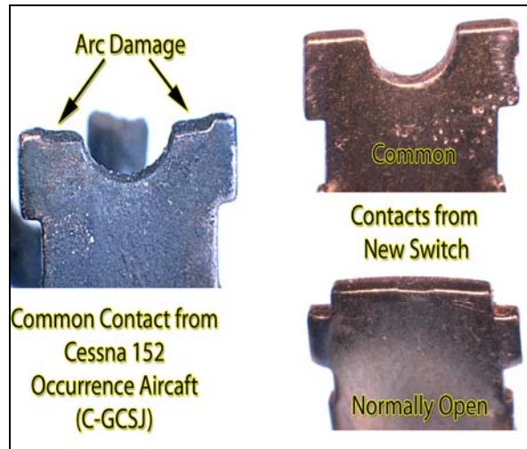
Photo 3. Arc damage

Arcing produces very high temperatures and is dependent upon the applied voltage and current. Typically, switch arcing, a phenomenon common to most switches, is of limited duration and isolated to small areas. The occurrence switch was wired such that it directly controlled the 250-watt incandescent lamp. According to the United States Federal Aviation Administration (FAA) Advisory Circular 43.13-1B (pages 11-16), this type of lamp can have an initial current up to 15 times the continuous current needed to remain on. This is because the cold filament has a lower resistance than a hot filament, thus the initial current could be as high as 134 amps, resulting in intense arcing. The only restriction would be the current limitations of the power source. Every time the landing light switch was selected to ON, the electrical current would produce an arc that, with repeated use, would erode the areas where the arc contacted the switch's copper components (see Photo 3). The fit between those components would be affected to the point where continuous arcing could occur even under normal loads.