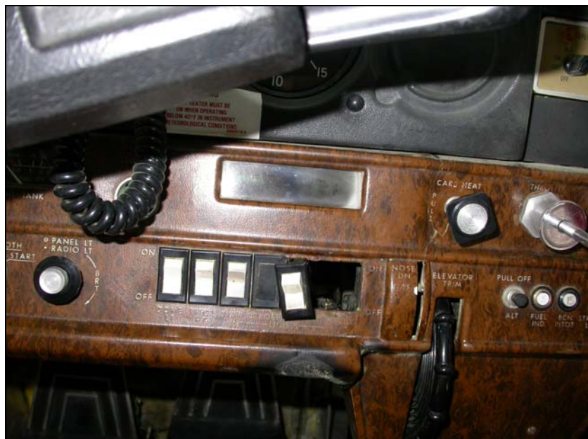
Photo 1. Front of instrument panel

As the aircraft flew by Bowmanville, the pilot and passenger detected an electrical burning odour. Approximately 10 seconds later, sparks were observed coming from underneath the lower left instrument panel. The pilot immediately turned back towards the Oshawa Airport and contacted the tower to advise them of their situation. The tower controller requested that the pilot call the tower at a recognizable landmark near the airport. After completing the transmission, the pilot switched off all of the electrical switches including the master switch. The pilot and passenger then observed small flames emanating from the bottom of the lower left instrument panel. The flames ignited the plastic instrument panel (see Photo 1).