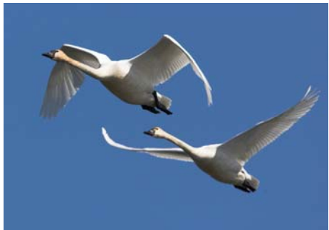
Species: Cygnus colombianus ; Tundra Swan

The goal of the survey is twofold: to characterize the strains of avian influenza viruses and to ensure early detection of highly pathogenic avian influenza strains in wild birds in Canada. Expanding on the 2005 nation-wide survey of influenza virus strains of wild ducks, this survey places a greater focus on birds that migrate regularly between Canada's North Atlantic region and Europe or that spend some part of their year in close proximity to birds that winter in Europe. The expansion of the survey complements work being carried out in the United States, which is surveying western (Pacific Flyway) populations.