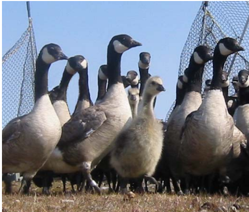
Species: Branta hutchinsii Cackling Goose

The goal of the survey is twofold: to characterize the strains of avian influenza viruses and to ensure early detection of highly pathogenic avian influenza strains in wild birds in Canada. Expanding on the 2005 nation-wide survey of influenza virus strains of wild ducks, this survey places a greater focus on birds that migrate regularly between Canada's North Atlantic region and Europe or that spend some part of their year in close proximity to birds that winter in Europe. The expansion of the survey complements work being carried out in the United States, which is surveying western (Pacific Flyway) populations.